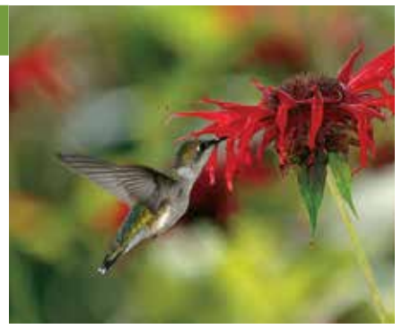
Ruby-throated hummingbird drinking nectar from scarlet beebalm - Monarda didyma

Hummingbirds feed by day on nectar from flowers, including annuals, perennials, trees, shrubs, and vines. Native nectar plants are listed in the table near the end of this guide. They feed while hovering or, if possible, while perched. They also eat insects, such as fruit-flies and gnats, and will consume tree sap, when it is available. They obtain tree sap from sap wells drilled in trees by sapsuckers and other hole-drilling birds and insects.