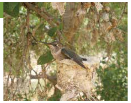
Black-chinned hummingbird nesting

Hummingbirds play an important role in the food web, pollinating a variety of flowering plants, some of which are specifically adapted to pollination by hummingbirds. Some hummingbirds are at risk, like other pollinators, due to habitat loss, changes in the distribution and abundance of nectar plants (which are affected by climate change), the spread of invasive plants, and pesticide use. This guide is intended to help you provide and improve habitat for