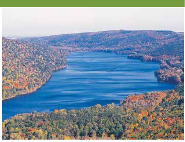
Candace Lake in the Finger Lakes, New York.

Hummingbirds get adequate water from the nectar and insects they consume. However, they are attracted to running water, such as a fountain, sprinkler, birdbath with a mister, or waterfall. In addition, insect populations are typically higher near ponds, streams, and wetland areas, so those areas are important food sources for hummingbirds.