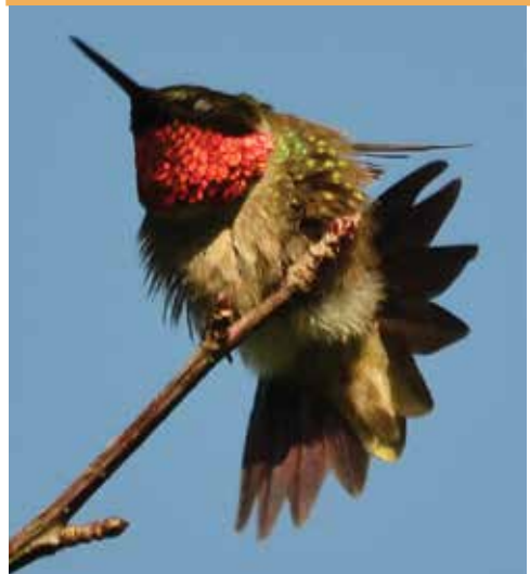
Ruby-throated Hummingbird—male

RANGE-Ruby-throated Hummingbirds are the only hummingbirds that breed in eastern North America, including southern Canada from Newfoundland to just west of the Alberta-British Columbia border. They occur regularly in 38 eastern states but only rarely as vagrants in the western U.S. By mid-October nearly all ruby-throats migrate to central Mexico or Central America as far south as western Panama, returning to Gulf Coast states as early as February before dispersing northward. Migration routes are not well-understood; some ruby-throats have been observed in trans-Gulf