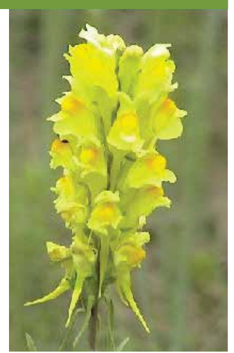
Yellow Toadflax

The following table (Hummingbird Nectar Plants for Ecoregions in the Eastern U.S.) lists some plants that are nectar sources for hummingbirds. These plants are native to The Eastern U.S., and are adapted to conditions in the ecoregions indicated in the table. The table also provides basic information on habitat and light, soil, and water needs. Finally, the tables provide seed sources for each plant valid as of November 2016. A directory of the seed sources follows the tables. Use locally-adapted genetically appropriate plants in all your restoration and pollinator enhancement work. Seed zones-areas with genetically similar plants-help determine the right plant materials to use; poorly chosen plants usually fail to thrive. See http://fs.bioe.orst.edu/web_maps/ Seed_Zones.html for provisional seed zones of the Eastern U.S., and select plant materials from your