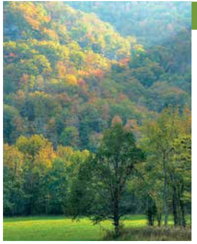
Fall in the Ozarks, Northwest Arkansas

Whether you're involved in managing public or private lands, large acreages or small areas, you can make them attractive to our native hummingbirds. Even long, narrow pieces of habitat, like utility corridors, field edges, and roadsides, can provide important connections among larger habitat areas.