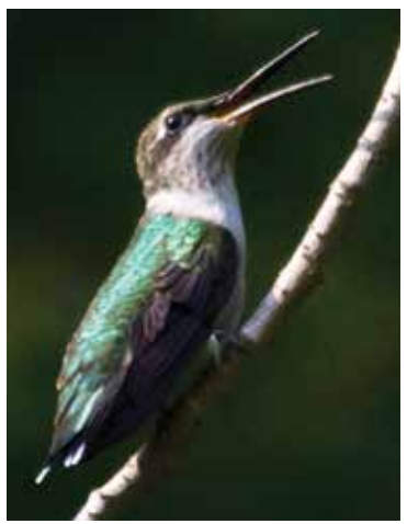
Ruby-throated Hummingbird—female

red gorget gives the species its name. Adult males also have iridescent green backs, dark flanks, and forked tails with pointed dark feathers. Females of any age are green-backed and all white beneath, including the throat; tips of the outer three tail feathers are rounded and white. Immature (first year) males resemble females—including the tail; their throats may be all white, streaked in green or black, and/or with one or more red feathers. Although adult males in some other western North American species have metallic red gorgets (e.g., Broad-tailed Hummingbirds), they should not be called or confused with "ruby-throats."