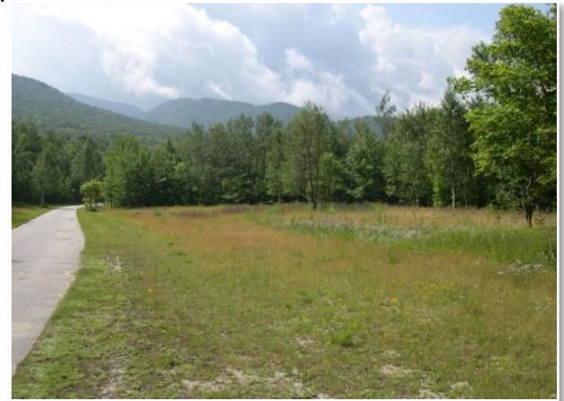
Brown knapweed ( Centaurea jacea ) treatment site along Skoookumchuck Bike Path

Control efforts also continued at the New Boston Air Station via an inter-departmental agreement with the Department of Defense. Although a much smaller land base than the Forest, New Boston is heavily infested with a Variety of NNIS. Funding from the Department of Defense