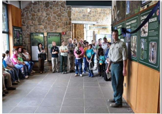
Ribbon cutting for the invasive species display at Seneca Rocks

Contact: Kent Karriker, 304-636-1800 x 169.