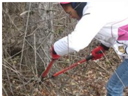
Cutting buckthorn with tools loaned from the Upper Chippewa Invasives Cooperative and the CNNF