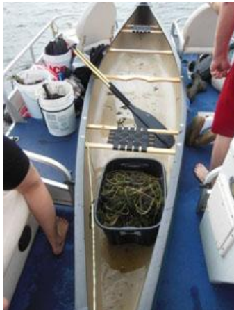
Eurasian watermilfoil (Myriophyllum spicatum)