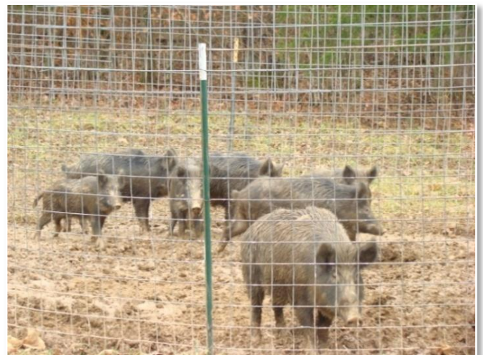
Figure 1. Trapped feral hogs

The Forest executed a new Interagency Agreement with APHIS in 2012. APHIS trapped and removed over a 102 feral hogs from six active trap sites reducing impacts and improving habitat on over 25,000 acres of NFS lands. In addition the Missouri Department of Conservation stepped up its efforts on State and private lands and assisted the Forest in targeting and trapping several hogs on Houston/Rolla and Eleven Point Ranger Districts.