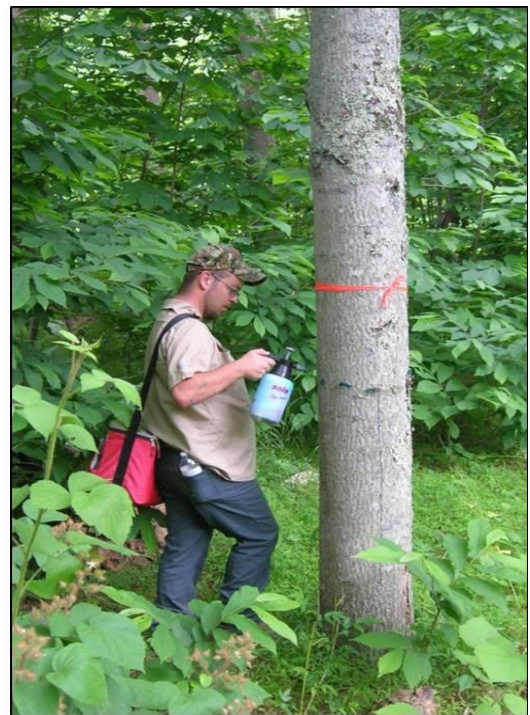
Hack & squirt treatment for tree of heaven