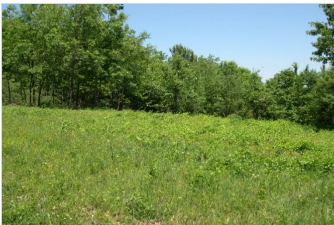
Shooting Field at New Boston Air Station infested with Oriental bittersweet ( Celastrus orbiculatus )

covers part of a seasonal botanist’s salary, as well as paying for permanent WMNF staff to help with eradication projects. This experience has proven useful for our staff, as they are exposed to NNIS infestations much different than what we see on the Forest. Not only are infestations much more extensive, but a number of species occur at New Boston that are not yet present on the Forest. This has allowed our employees to develop an ‘eye’ for these species, both close-up and at a distance, which should prove to be useful in our early detection efforts.