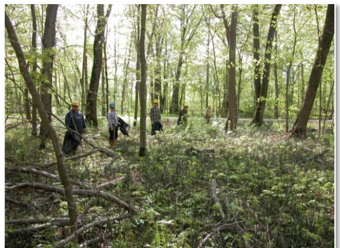
CMMI workers pulling garlic mustard in maple stand

The Ash Diversification EA has been moving along VERY SLOWLY. It's still considered a viable project, but may be delayed now with the blow down and a shift in priorities for the Forest. The Forest has been tending the American elm restoration plantings and Jim Slavicek, the lead research from Northern Research Station in Delaware, OH, will be here the week of September 17 to review the plantings and help us take measurements on all the trees.