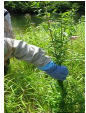
Purple loosestrife (Lythrum salicaria)