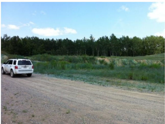
CNF Noma Gravel pit just after treatment with herbicide Blue dye is used to assure good coverage and prevent accidental contact with treated plants

Gravel pits are a notorious source of invasive and noxious weeds such as common tansy, spotted knapweed, and creeping thistle. These weeds establish readily in the nutrient poor soil of a gravel pit, seeds accumulate in the soil, then are spread to road maintenance and construction sites throughout the Forest. While it isn't usually feasible for us to treat the thousands of acres infested with these weeds, we can prevent further spread by going after the source.