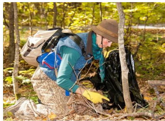
The Eagle River-Florence District installed two boot brushes at the Anvil National Recreation Trail where volunteers removed 30 pounds of garlic mustard as part of National Public Lands Day.