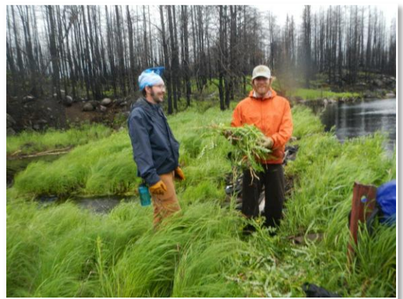
SCA crew pulling NNIP in Pagami Creek Fire burned area

Earthworms: Approximately 500 acres involving 1,017 sample points were inventoried for presence/absence and severity of earthworm impacts in 2012.