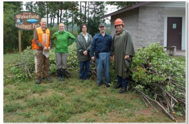
Gogebic Conservation District & USFS treating glossy buckthorn at Sunday Lake in Wakefield

Title II Resource Advisory Committees funded six ongoing invasive plant projects: Friends of Sylvania again hired three seasonals to survey and control invasive plants in Sylvania Wilderness. Gogebic Conservation District treated garlic mustard. Invasive Species Control Coalition of Watersmeet (ISCCW) did boater education. Duck Lake treated 5 acres of Eurasian watermilfoil. An additional seasonal FS employee was funded for invasive plant work. New aquatic invasive boat launch signs were installed in Ontonagon County. Seven new invasive species RAC proposals were awarded for work in the coming years.