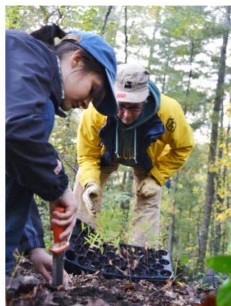
College interns plant native tick-seed & milkweed to restore NNIS control sites

Wayne National Forest 13700 US Hwy 33 Nelsonville, OH 45764