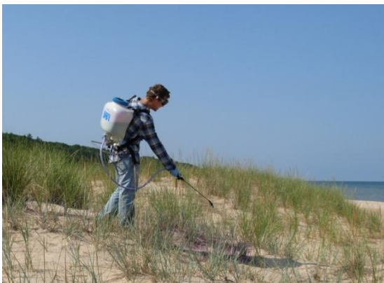
Spot spraying Lyme grass along the Lake Michigan shoreline

Contact: Carol Young, Forest Sivilculturst, 231-775-5023 ext. 8760 or cayoung@fs.fed.us