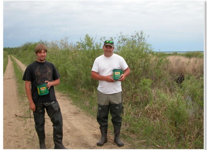
IWLP Workers ready to release loosestrife biocontrol insects

Biocontrol 170 Hand pulling 87 Herbicide 10