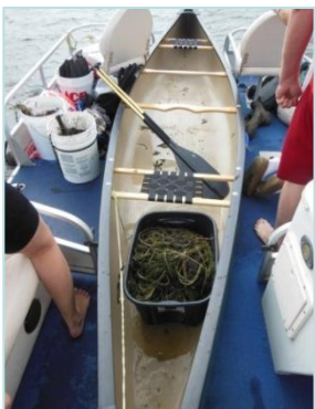
The CNNF teamed with the Ottawa to hand-pull Eurasian water mifoil on Lac View Desert