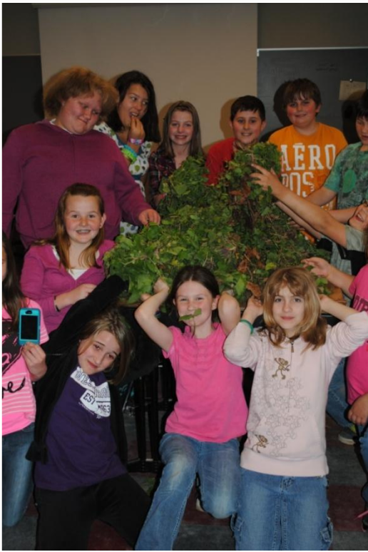
Petersburg Elementary students with their haul of garlic mustard