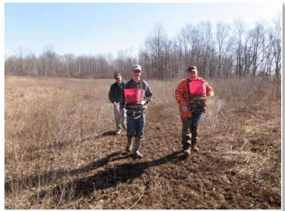
Nat. Wild Turkey Federation volunteers & Forest Service personnel applying native seed in a wildlife opening