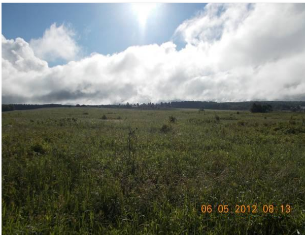
Figure 1: A typical FLNF grassland, where a mix of rare plants, common grassland plants, and NNIP resides