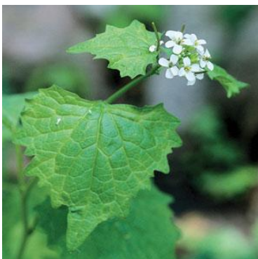
Garlic mustard (Alliaria petiolata)