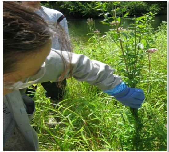
Hand swiping Purple loosestrife with herbicide along the Au Sable River

The Forests' Botanists also provided presentations to interested and affiliated groups, including the Lake Bluff Audubon Society, Plant It Wild, the Lions Club, CasMan Academy, the Rotary Club, and Huron Pines.