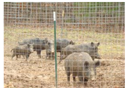
Feral pigs (Sus scrofa)