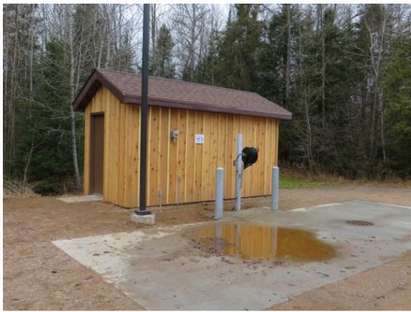
New boat washing station at Hagerman Lake

Title II Resource Advisory Committees funded six ongoing invasive plant projects: Friends of Sylvania again hired three seasonals to survey and control invasive plants in Sylvania Wilderness. Gogebic Conservation District treated garlic mustard. Invasive Species Control Coalition of Watersmeet (ISCCW) did boater education. Duck Lake treated 5 acres of Eurasian watermilfoil. An additional seasonal FS employee was funded for invasive plant work. New aquatic invasive boat launch signs were installed in Ontonagon County. Seven new invasive species RAC proposals were awarded for work in the coming years.