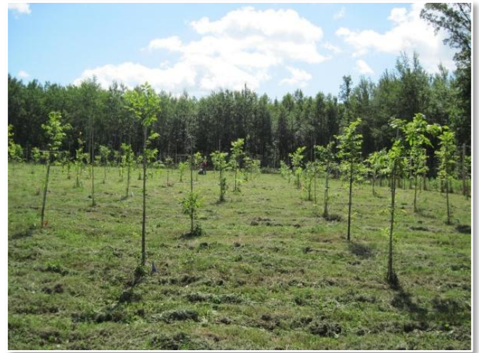
Nursery planting of Dutch elm disease tolerant elm trees