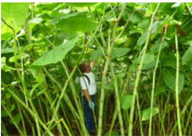
Japanese knotweed (Fallopia japonica)