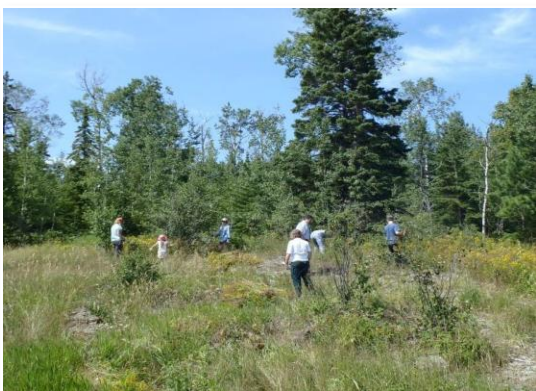
Volunteers helping at a public weed pulling day at Pincushion Mountain trailhead.

Secure Rural Schools: City of Ely, MN, received SRS funding and treated 15 acres of buckthorn as well as educating residents about buckthorn control.