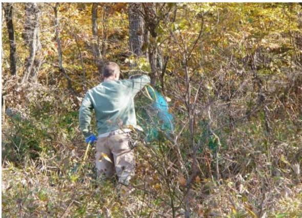
NNIS-IDIQ contractor performing selective herbicide treatment to non-native invasive shrubs

The Forest continued its program to enhance early successional habitat (ESH) and pollinator resource areas. At these sites, the Forest conducted clearing by bushhogging, used herbicide to spray dense infestations of tall fescue and other exotic pasture grasses then seeded these old fields with native seed using a no-till seed drill.