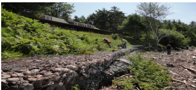
Figure 1. CUPCWMA NNIP crew pulling spotted knapweed from the slope at Mather Lodge on Grand Island, Lake Superior

The NNIS program expanded by coordinating with 2 cooperative weed management areas (CWMA’s), volunteers, and other HNF resource programs. The Eastern UP CWMA and volunteers helped remove NNIP from piping plover (federal endangered), Pitcher’s thistle, and Houghton’s goldenrod (both federal threatened) areas. Youth Conservation Corps removed NNIP impacting piping plover habitat along Lake Michigan. Volunteers assisted with NNIP removal from high priority locations, such as Grand Island NRA and garlic mustard sites. The Central UP CWMA weed crew removed NNIP and conducted mapping and monitoring in Big Island Lake and Rock River Canyon wilderness areas. The Round Island Rendezvous included 18 volunteers from several HNF program areas and the Huron-Manistee National Forest who removed 48 bags of NNIP from the island (Figure 2). The main NNIP pulled were spotted knapweed, non-native thistles, and St. John’s wort. NNIP in timber sale areas were treated with herbicide and manual removal methods prior to seeding with native species.