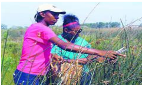
North Lawndale Prep School and YCC managed to clip over 700 pounds of cattail heads this summer despite the daunting heat!

The main purpose of this training was to provide a “hands on” experience that would allow folks to become familiar and comfortable with using, maintaining and troubleshooting backpack sprayers. The knowledge gained from this training also increases safety awareness. All present at the training are now extremely comfortable in these areas; equating to well maintained, safer equipment as well as more productive time taking care of those invasives!