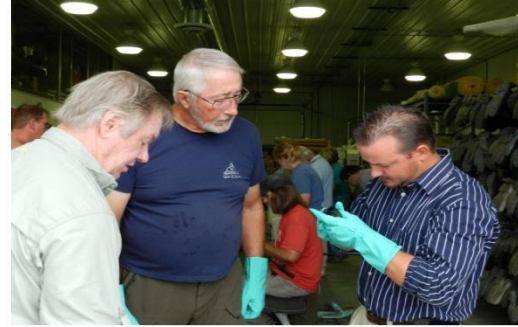
SOLO Representative, Thornton, showing volunteers various components of backpack sprayers

Contact: Delane M. Strohmeyer, 815-423-6370 x 251 or dmstrhmeyer@fs.fed.us