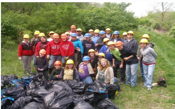
A very successful garlic mustard workday with a crew of 49 volunteers!

Midewin National Tallgrass Prairie 30239 S. State Route 53 Wilmington, IL 60481