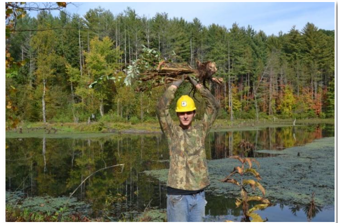
Volunteer removes autumn olive at wetland during National Public Lands Day event.