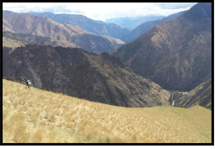
Treating rush skeletonweed in Pinto Creek in the Frank Church Wilderness.