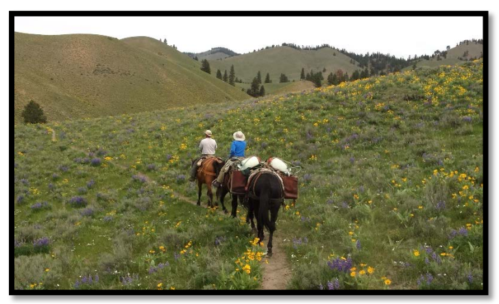
On the way to treat Houndstongue in Silverleads on the North Fork Ranger District.