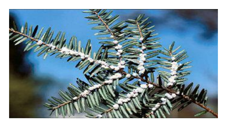
Hemlock woolly adelgid (Adelges tsugae) infestation

ANF and State & Private Forestry (S&PF) staff worked with the Pennsylvania Department of Conservation and Natural Resources to host two workshops aimed at training volunteers to identify and report HWA infestations in northwestern Pennsylvania. An additional workshop was held in southern New York (Allegheny State Park). Participants observed HWA first-hand and gained experience in detection, monitoring, and reporting protocols. They also had an opportunity to volunteer for the "Adopt-a-Hemlock" program to conduct surveys and report new infestations in local hemlock forests. To date, about 50 areas have been adopted by trained volunteers to complete HWA as possible while out in general forest areas. HWA was discovered for the first time in Allegheny State Park by volunteers who participated in the volunteer training workshop.