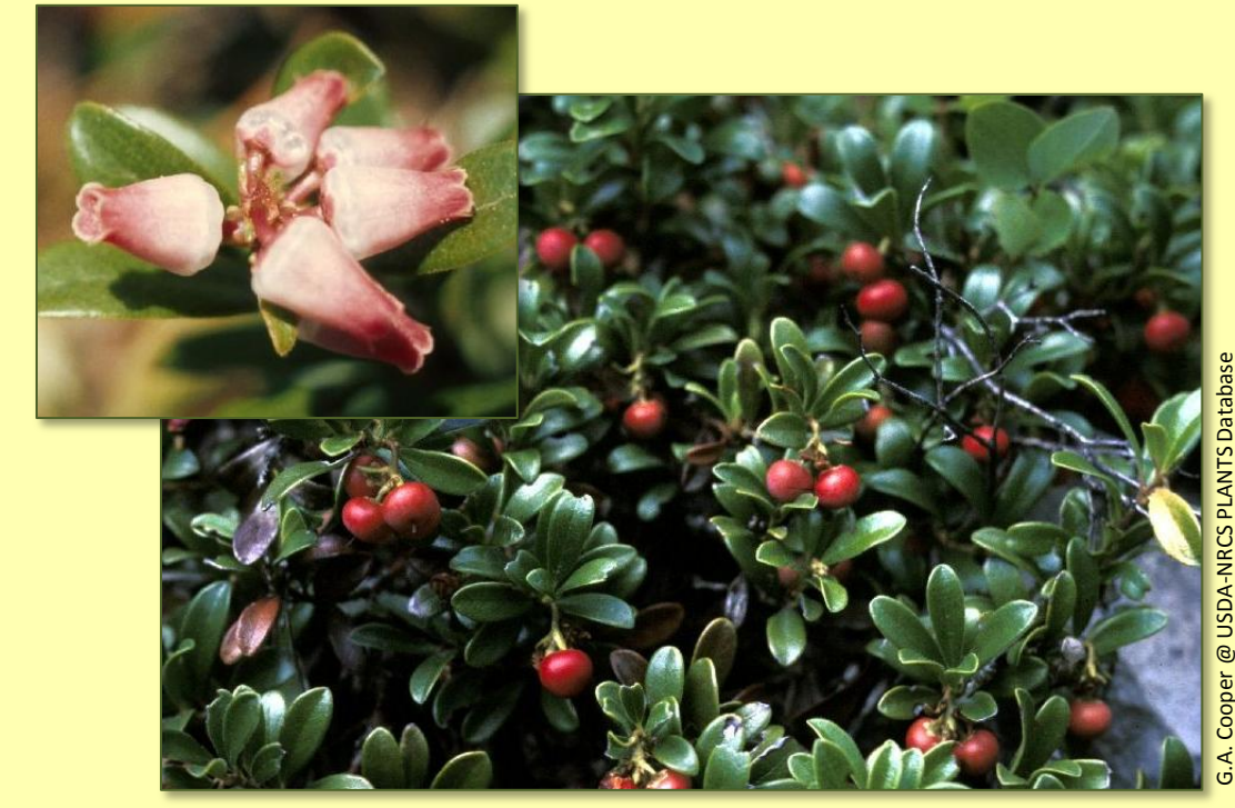
The attractive flowers and colorful berries of bearberry (Arctostaphylos uva-ursi), also called kinnikinnick, make it a popular ground cover. The berries are a food source for wildlife.