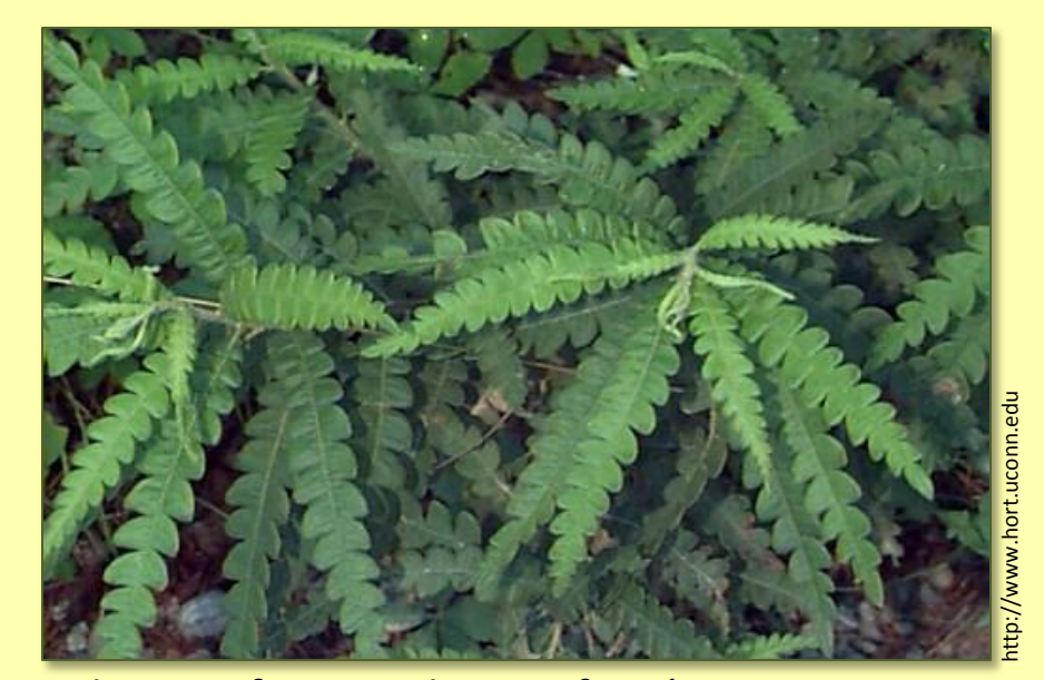
An indicator of poor soil, sweetfern (Comptonia peregrina) is not really a fern at all; look for its woody stems. Its leaves are very aromatic when crushed.

One of autumn's showiest flowers, New England aster (Symphyotrichum novaeangliae) attracts moths and butterflies, and is an important source of nectar for bees.