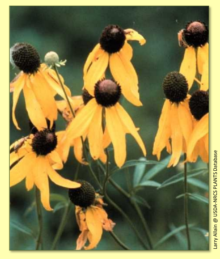
Grey-headed coneflower (Ratibida pinnata) attracts butterflies and is a food source for birds in the fall.

The species of native plants you see here have been growing in this region since before European settlers arrived. Native plants are important habitat for wildlife, providing food and shelter.