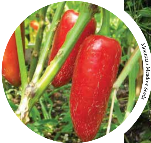
Mountain Meadow Seeds

Conservation is most effective when a complementary approach involving both in situ and ex situ strategies is employed. The two strategies act as backups to each other and maximize the potential for cost-effective, long-term conservation of alleles, genotypes, and populations.