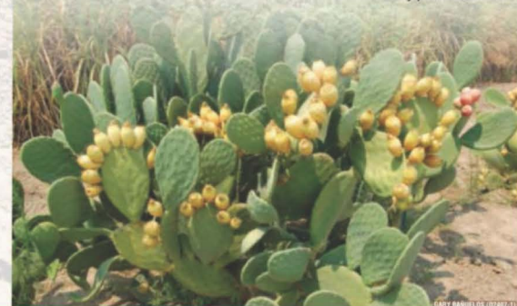
GARY BAÑUELOS (02407-1)