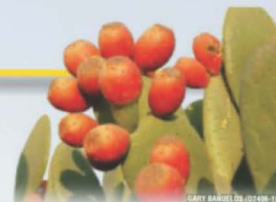
GARY BAÑUELOS (02405-1)

Prickly pear was thought to be sensitive to high salinity. But the study results showed that tolerance to salt and boron depends on the genotype. The cactus variety from Chile had the highest tolerance and was the best at producing fruit and accumulating and volatilizing selenium. Many of the plants grown in test plots were smaller and produced less fruit than those in control plots, but some varieties actually grew better in the test plots. The results were promising enough for selected prickly pear