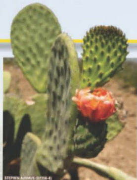
STEPHEN AUSMUS (02354-4) Newly emerging cladode with flower on field-grown prickly pear cactus, Opuntia ficus-indica .

The west side of the San Joaquin Valley in California presents several challenges to growers. Ancient seas that once covered the area left behind marine sediments, shale formations, and deposits of selenium and other minerals. Anything grown there needs to be irrigated, but the resulting runoff, when it contains high levels of selenium, can be toxic to fish, migratory birds, and other wildlife that drink from waterways and drainage ditches. Selenium runoff is subject to monitoring by regional water-quality officials. Periodic droughts and population growth are also