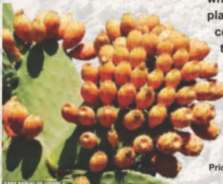
GARY BAÑUELOS (02405-1)

The west side of the San Joaquin Valley in California presents several challenges to growers. Ancient seas that once covered the area left behind marine sediments, shale formations, and deposits of selenium and other minerals. Anything grown there needs to be irrigated, but the resulting runoff, when it contains high levels of selenium, can be toxic to fish, migratory birds, and other wildlife that drink from waterways and drainage ditches. Selenium runoff is subject to monitoring by regional water-quality officials. Periodic droughts and population growth are also