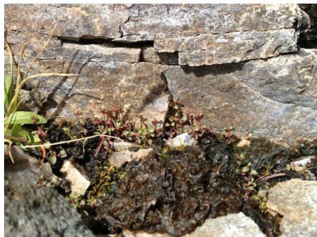
Figure 2. Typical patch size for M. gemmiparus is on the order of 1 dm 2 and rarely exceeds 1 m 2 . The patches in these photos are part of the Saint Vrain population.