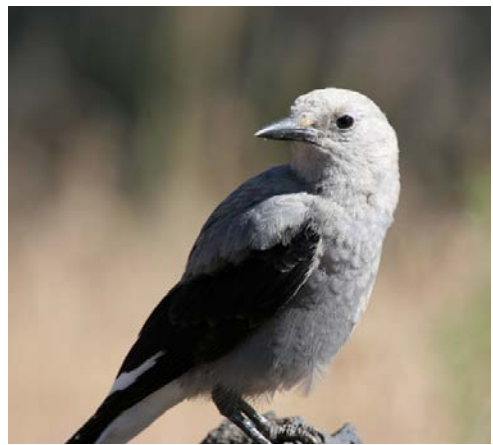
Clark's nutcracker.

is significantly higher fat content than most other bear food sources. Female bears consume more whitebark pine seeds than males, and female grizzly bears that frequently made use of whitebark pine seeds reproduced at an earlier age and exhibited higher reproductive rates than females who consumed few pine seeds. The bears obtain seed by raiding red squirrel middens (Mattson and others, 1991).