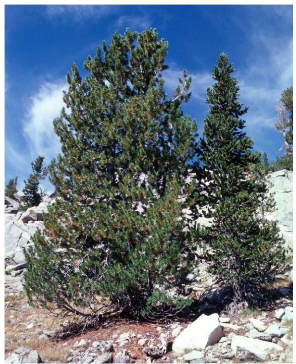
Whitebark pine (left).