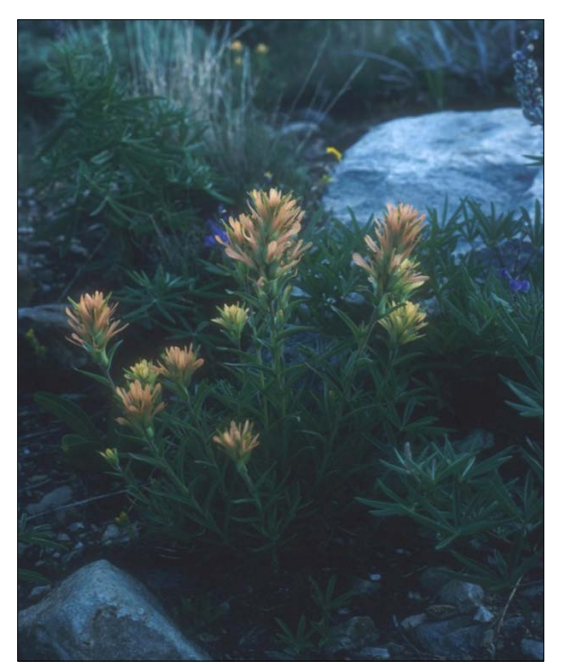
Christ's paintbrush (Castilleja christii).