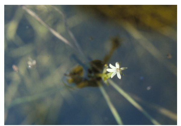
Water howellia ( Howellia aquatilis ).