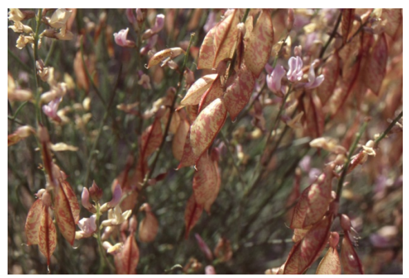
Seed pods and flowers of Packard's milkvetch ( Astragalus cusickii var. packardiae ).

Plant Symbol = ASCUP Listing Status: Candidate