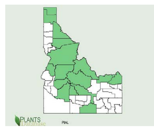
Distribution of whitebark pine in Idaho. Image from the PLANTS Database. USDA-NRCS, 2011.

Distribution : Whitebark pine trees are found on cold wind-swept ridges and peaks in western North America. Many stands are geographically isolated. Populations occur from the coastal mountain ranges of British Columbia, Washington and Oregon, south to the Sierra Range of California and east to the Rocky Mountains of Idaho, Montana, Wyoming and Alberta with scattered populations in the Great Basin. For current distribution, consult the Plant Profile page for this species on the PLANTS Web site.