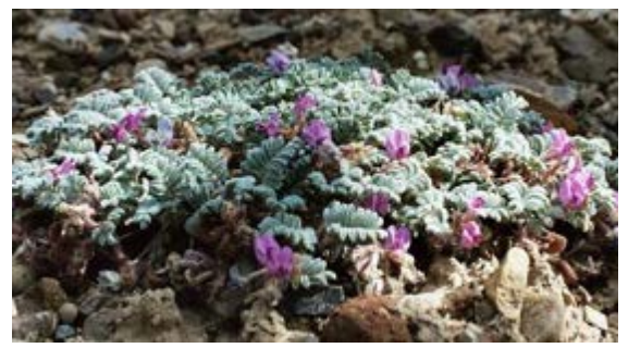
Goose Creek milkvetch ( Astragalus anserinus ).

Plant Symbol = ASAN7 Listing Status: Candidate