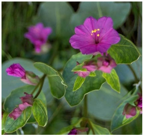
MacFarlane's four-o'clock (Mirabilis macfarlanei)

Plant Symbol = MIMA2 Listing Status: Endangered