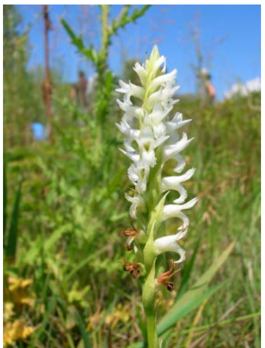
Ute ladies' tresses ( Spiranthes diluvialis ).

Plant Symbol=SPDI6 Listing Status: Threatened