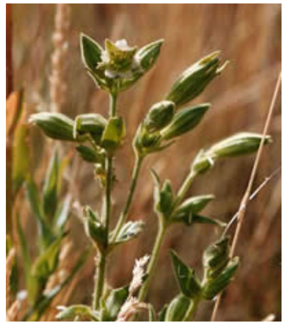
Spalding's catchfly. Photo by C. Menke

Plant Symbol = SISP2 Listing Status: Threatened