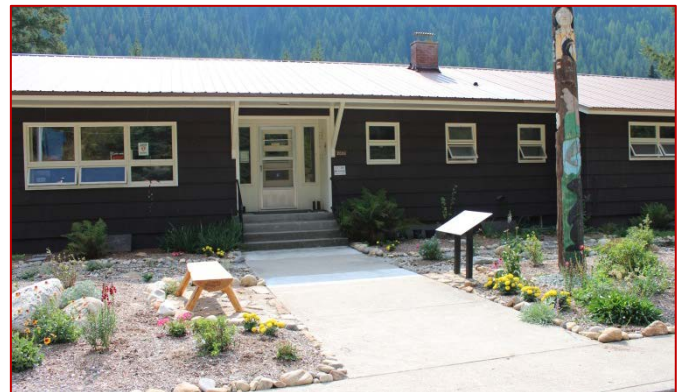
Kelly Creek Work Center Entryway

The sight of busy bees and butterflies working in the garden throughout the summer and fall was just one of the rewards this project produced. Another resulting benefit was the enthusiastic investment in a common goal that fostered new friendships and increased interest in stewardship of public lands. Who knows what this garden will grow next!