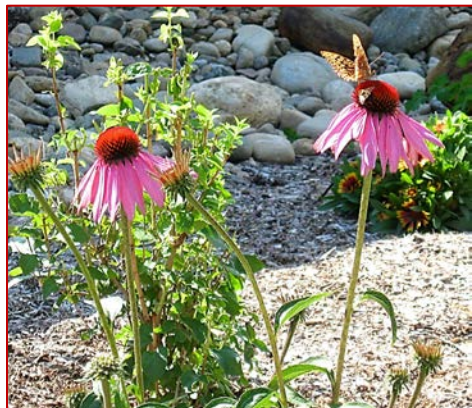
The Garden's Bounty of Rewards!