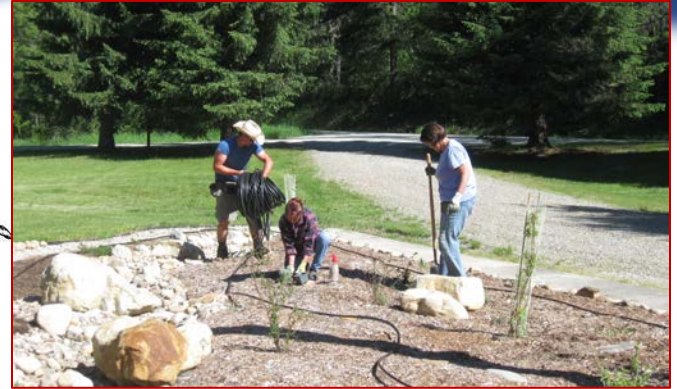
Installing the Irrigation System

While the garden was successful at attracting pollinators of the winged variety, it also received attention from a few voracious herbivores. Keeping the deer and ground squirrels at bay required a bit of creative ingenuity this year! But the human visitors seemed to enjoy watching all of the developments as the garden matured throughout the season.