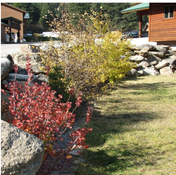
Above: Fall color in the garden.