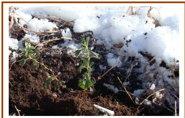
Bitterbrush shrubling planted in burn area

Native Plant Material funds were used in 2010 & 2011 to plant shrublings in areas where native species restoration is a high priority within burned areas.