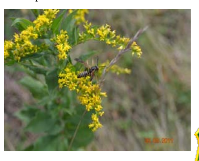
Rough-stemmed goldenrod (Solidago rugosa) with pollinator.