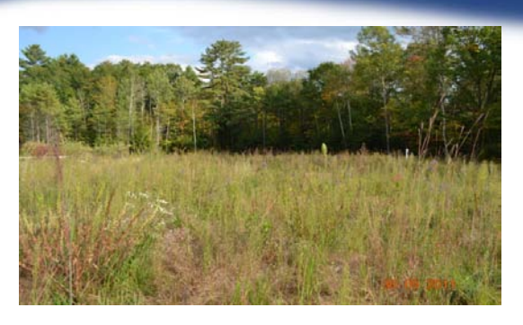
Wildflower seed production meadow on leach field of the WMNF Administrative Complex.