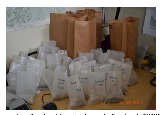
A small portion of the native plant seed collected on the WMNF drying in the office.