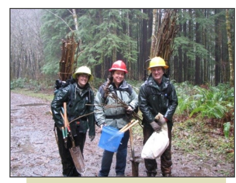
Above: Livestakes collection crew

Left: Torreyochloa pallida plugs propagated for the Pine Lake restoration project.