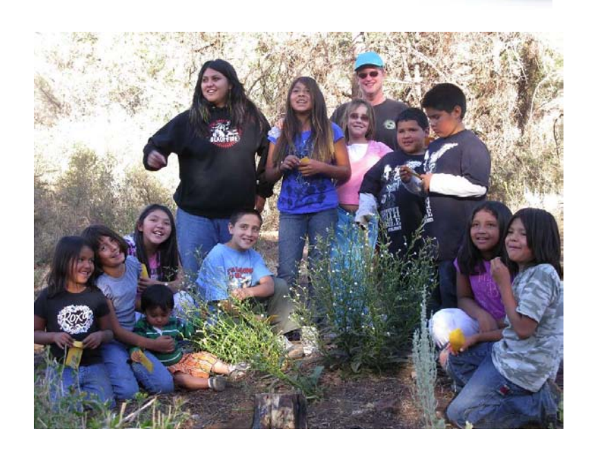
Figure 2. Cedarville Rancheria youth collecting coyote tobacco seed.

This project was initiated to restore native covote tobacco (Nicotiana attenuata) on the Modoc National Forest and to provide a partnership to reconnect Native American Youth with their traditional cultural relationship this this plant species. Coyote tobacco thrives in response to fire, both wildfire and pile burning. However, it appears to be declining on the Modoc National Forest and is seen only infrequently following fire. During the fall of 2009, tribal members of the Cedarville Rancheria and an associated organization, Cultural Advocates for Native Youth, collected coyote tobacco seed from two areas on Modoc National Forest and adjacent BLM lands. This seed was sown on pile burn sites on the Forest in the spring of 2010. Additional seed was collected from Modoc NF and adjacent BLM lands in the summer of 2010. Seed from these sites will be sown in the fall of 2011. More seed collection will occur in the fall of 2011 for planting in 2012. A total of approximately one acre of coyote tobacco is expected to be restored across several Forest sites as a result of this project. Approximately 0.75 acre is expected to be sown within the September 2010 Cougar wildfire areas.