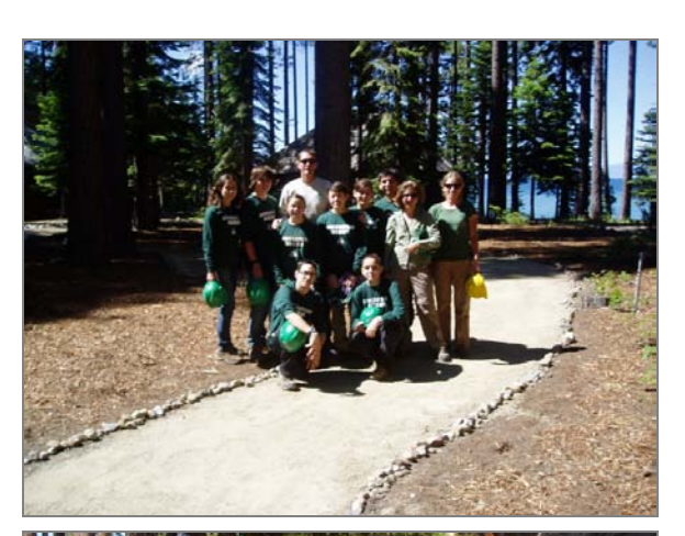
Figure 1 (left): Site preparation completed. Figure 2 (below): Galisdungs!