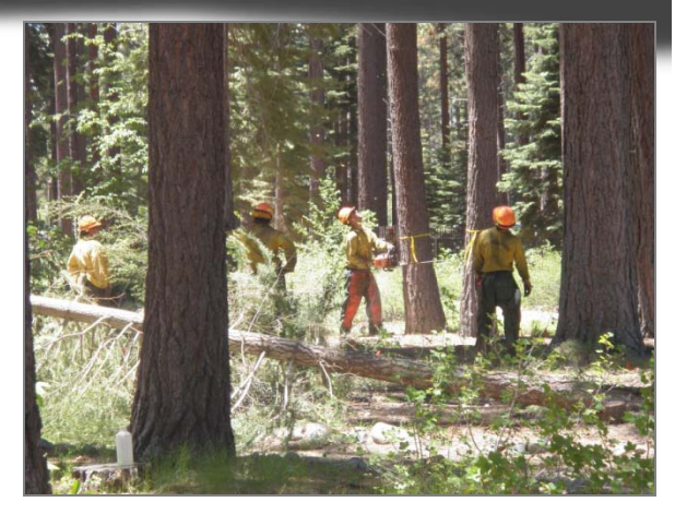
Figure 3 (above): FS Crew removing trees. Figure 4 (below): Generation Green, Washoe Tribe, and FS employees prepare the garden site and incorporate compost into the soil.