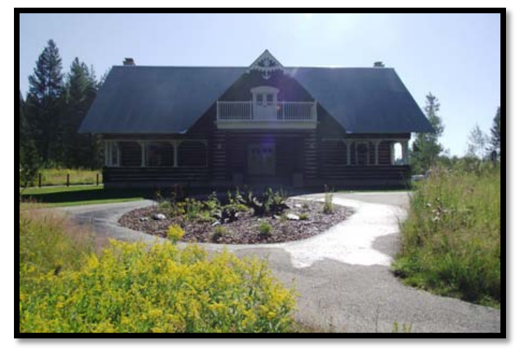
Figure 2: Native Planting at Upper Mesa Falls Visitor Center

Year Awarded: 2011 Project completion: 2015