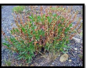
Figure 3: Bush penstemon (Penstemon