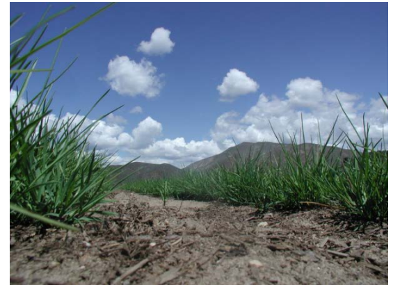
First year establishment of a Sandberg bluegrass seed increase plot at Lucky Peak Nursery. This 1.3 Acre plot is expected to yield seed in 2012 and 2013.

Blue wildrye: In FY 2011 we spent $2,000 to maintain and harvest seed from a 0.3 acre seed increase plot at Lucky Peak Nursery. The seed was planted in fall of 2010. In FY11 ~ 36 lbs of seed. Additional seed yields are expected in 2012 and 2013. We anticipate 200+ lbs over the next two years.