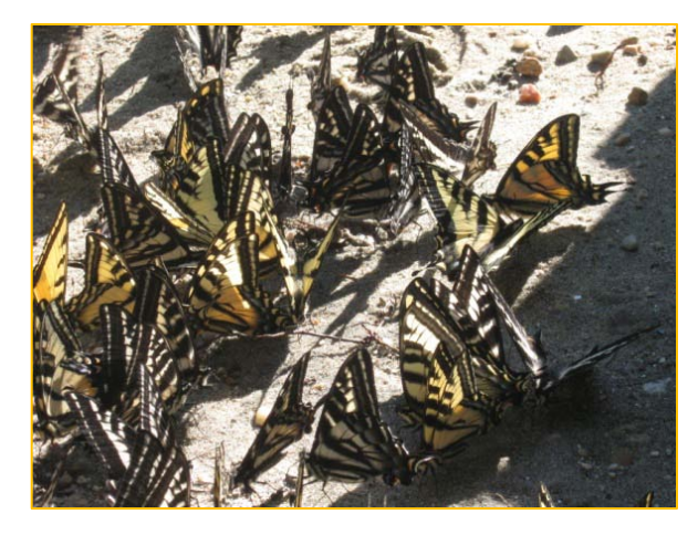
Swallowtails gather en masse at garden site in June & July of 2011!

By October, district personnel, garden club members, local nurseries, and a local contractor had contributed over 100 hours toward the garden's development. Plant propagation and out-planting for 2012 will involve collaboration with the local garden club as well as teachers and students from the Timberline school.