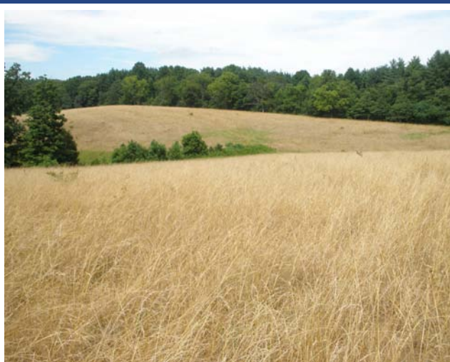
View of the Stillion Tract following the initial herbicide application to prepare the area for fall 2010 native seeding with seed drill.

Year Awarded: FY 2010 Project completion: (2010) Report number: (1 of 1)