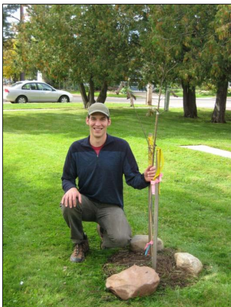
Figure 1. Princeton elm planted on the Washburn Ranger District, Chequamegon-Nicolet National Forest.

Participating forests will also receive an interpretive wayside exhibit that shares the story of the devastation caused by Dutch Elm Disease and the return of this tree to America's forests and cities. Elm researchers from Northeastern Area S&PF provided research to aid in the development of the interpretive wayside exhibit. Project completion is expected in November 2010.