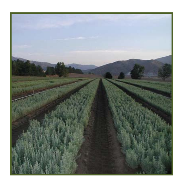
Sagebrush seed increase field at Lucky Peak Nursery.

Final 2010 seed harvest amounts for Bluebunch Wheatgrass, Idaho Fescue, and Parsnip Flowered Buckwheat were not available for this reporting period.