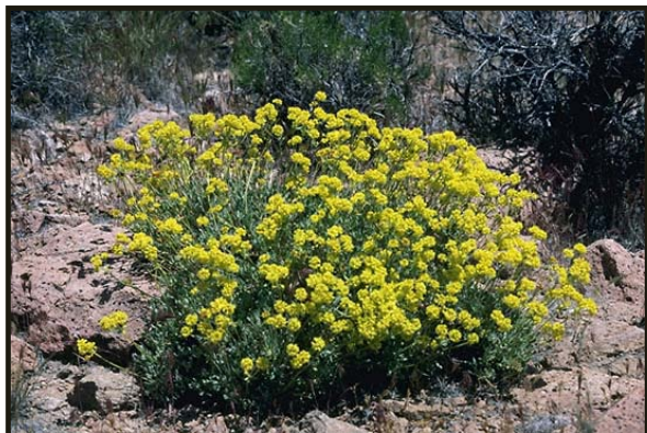
Sulfur Buckwheat one of the native species that was collected on the Minidoka RD.

Currently contract modifications for Pinegrass and Indian Ricegrass are being considered and will be determined after bulk seed testing of 2010 collection. Other modifications are for the substitution of Silver and Broadleaf Lupine for Silky Lupine and Parsnip Flowered Buchwheat for Sulfur Buchwheat seed. Modifications are due to lack of species abundance for collection and "crop failure" in increase plots of Silky Lupine, Pinegrass and Sulfur Buckwheat due to possible acclimation or water stress.