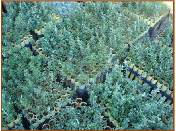
Bitterbrush shrublings for restoration of wildlife winter range and areas burned by wildfire

A portion of the NFN3 FY10 $64,000 funding is being used to plant these seedlings in areas where genetically local native species restoration is a high priority.