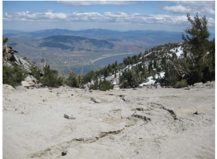
Figure 1: Graded section of Upper Bonanza Run, Mt. Rose Ski Resort, Humboldt-Toiyabe NF

• Washoe Nursery, managed by Nevada Division of Forestry was contacted to provide the containerized plant materials. The ski run is scheduled to be planted in the spring and fall of 2012. At that time the woodchips will have decomposed to a stage where they will contribute organic matter to the site. In addition, the containerized plants will be of a sufficient size to better withstand the harsh growing conditions of this area.