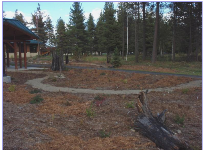
Two months later... perennial natives beginning to root and flower! September 27, 2010