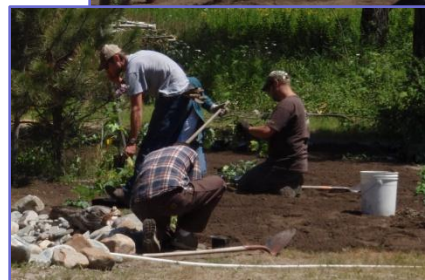
Forest Service crew preparing the site for planting, July 14, 2010.