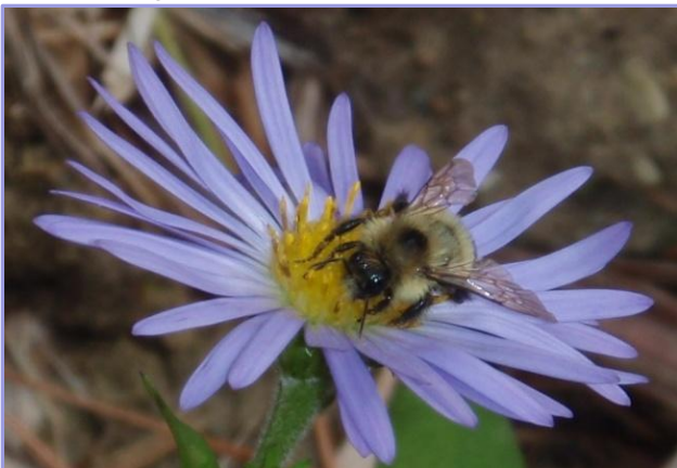
Bumblebee resting/feeding on aster in our garden! September 16, 2010