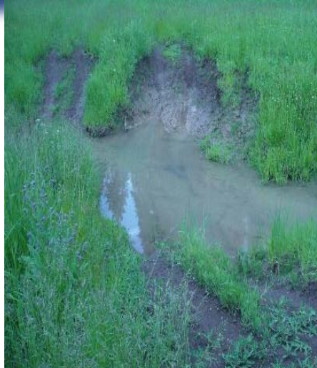
Meadow damage due to unauthorized ATV use

Meadow species collected include: Idaho fescue, mountain brome, blue wildrye, various sedges, California oatgrass, globe penstemon, camas, groundsel, Montana golden pea and others. Some of these may be developed into a seed mix while others may be nursery grown for out planting.