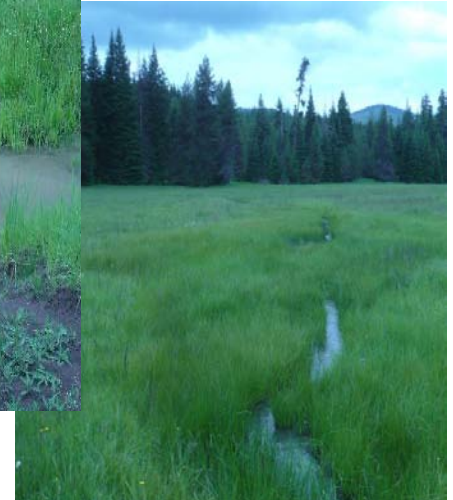
Seed collection focused on native plant communities in healthy meadow systems