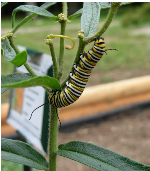
Figure 1. Monarch caterpillar on butterfly milkweed

A 24" x 36" sign was developed and printed that describes "The Ugly Truth about Non-native Invasive Plants: they may look pretty, but they have an ugly impact on the environment". It is a good complement to the "Benefits of Native Plants" and "Pollinator Friendly Practices" signs that were developed in 2008.