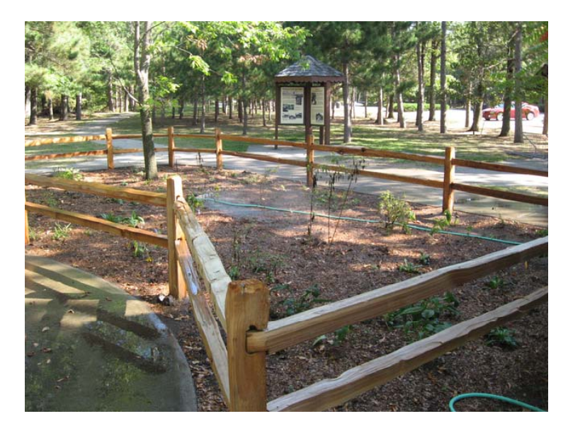
Figure 2: View of first garden near the visitor center.

This winter, we will hold meetings that will outline where the plans of the next planting beds for spring