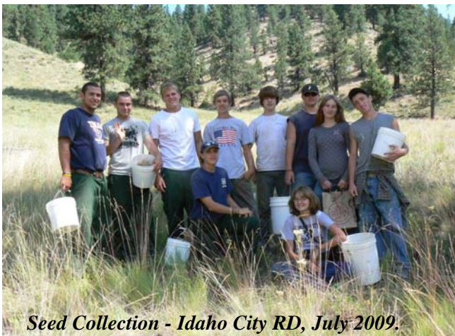
Seed Collection - Idaho City RD, July 2009.

The YCC crew collected grass seed on the ICRD that will be used in future restoration and seed increase.