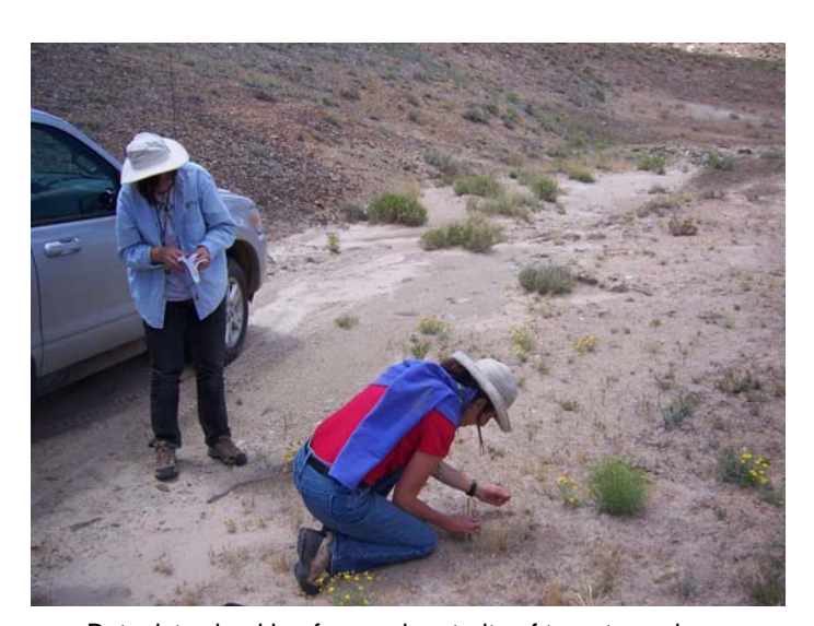
Botanists checking for seed maturity of target species.

Funds were obligated for CSU to plant and maintain a reclamation showcase garden at the Mancos/Dolores Ranger District office site. This garden will help restore some degraded land at the office site and serve as a learning tool for agencies, researchers, and the local community. Construction will begin in late fall 2009.