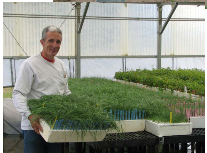
Lower figure: Grass seedlings in the Coeur d’Alene Nursery greenhouses in early spring.