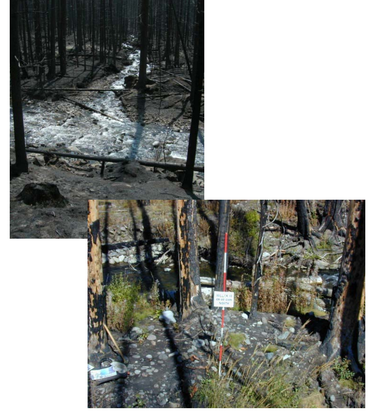
Photos post-fire in 2007 and 2009; planting to be completed in 2010

The project goal was to accelerate revegetation of dominant shrub communities in the Wicked Fire area. The Wicked Fire of 2007 burned approximately 26,500 acres within the greater Mill Creek drainage, a large 5th HUC drainage south of Livingston, Montana. The Wicked Fire burned at low, moderate, and high intensity and severity levels. These terms define the extent of vegetation removal and fire effects to soils and are critical factors in how well vegetation becomes reestablished post-fire. Approximately 55% of the area that burned at a moderate or high intensity also burned at a high soil severity. These areas of high severity occurred in large patches and included riparian zones. Many of the desired native shrubs sprout post-fire but this is strongly dependent upon the level of fire intensity. High severity fire killed the root crowns to a degree that sprouting did not occur in 2008. The summer of 2009 saw willow species sprouting but only in areas of high water availability.