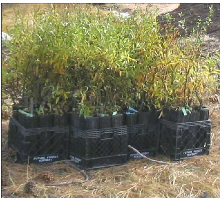
Native willows used for stream restoration project, which will be grown at the FRC Greenhouse.

The Plumas National Forest used its Native Plant Materials funding to enter into a Challenge Cost Share Agreement (Agreement # 07-CS-11051150-034) with Feather River Community College District for use of their Greenhouse Facility. The Agreement commits the College and the Plumas NF to a five-year partnership for shared use and maintenance of the Greenhouse. The agreement allows the Plumas NF use of up 1/3 of the square footage of the Greenhouse facility upon completion of maintenance to the Greenhouse water, heating and cooling systems. Native plant material funding from the Forest Service will be used by the college to make the greenhouse operational for use by the Plumas NF by Spring 2008.