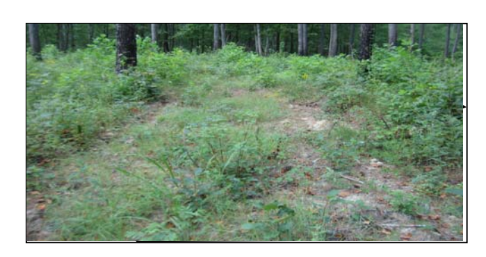
Results after mulching, burning, strip disking, and planting native warm season grasses.

During Fiscal Year 2006, Bankhead National Forest staff completed the Woodland Restoration Project of the Upper Cumberland Plateau Uplands Restoration Initiative. The purpose of this project was to demonstrate methods and results of initiating native pine woodland restoration. The following describes the methods used to begin pine woodland restoration on five demonstration sites on Bankhead. Through a mechanical fuels reduction project, midstory vegetation was removed in five mature pine stands, totaling 175 acres. In three stands, a woodland mulcher was used to remove midstory. In two stands, midstory was cut down with chainsaws. Prescribed burning was conducted during the growing season in three stands and the dormant season in two stands. Strip disking preceded hand-planting of native warm season grasses and forbs. A mixture of big and little bluestem grasses, partridge peas, Indiangrass, bundleflower, coreopsis, and rudbeckia seeds were broadcasted over approximately five acres in each stand. The Bankhead Liaison Panel and The Nature Conservancy of Alabama assisted Forest Service staff with monitoring of project progress and results. Both partners also participated in public field trips to the sites and provided information on the project at public meetings. Monitoring includes permanent photo-monitoring plots. Project progression was documented at photo points prior to treatment, post-midstory removal, pre-burning, post-burning, and post-disking and planting grass.