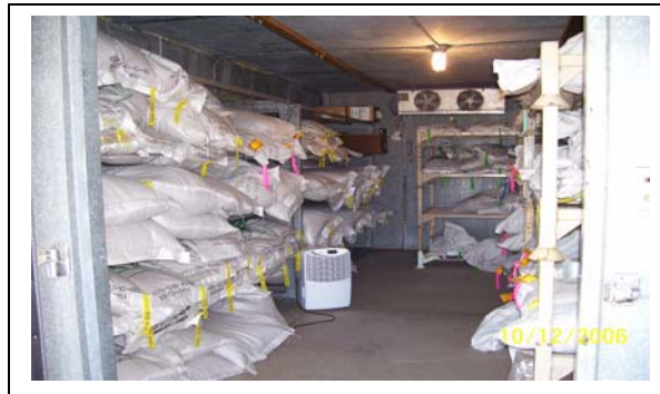
Native Seed Inventory in Storage at La Grande Ranger District