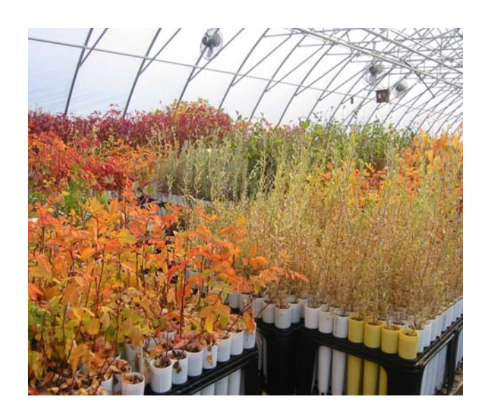
Buffalo Berry Greenhouse Container Stock.