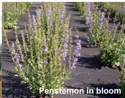
Penstemon in bloom