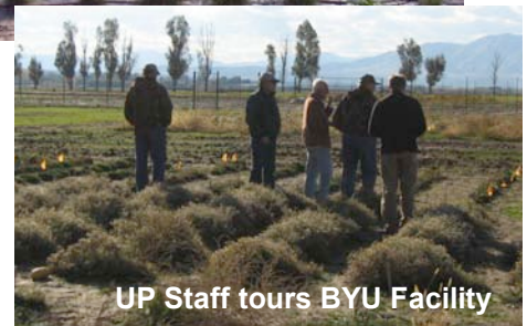
UP Staff tours BYU Facility