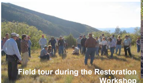
Field tour during the Restoration Workshop

In keeping with our goal of disseminating information on restoration techniques, the program co-sponsored a Plant Community Restoration Workshop with the Utah DWR in Ephraim, Utah with 70 participants from 7 western states. This workshop was an excellent opportunity to bring together land managers, community members and scientists to share knowledge on our regional ecosystems.