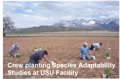
Crew planting Species Adaptability Studies at USU Facility