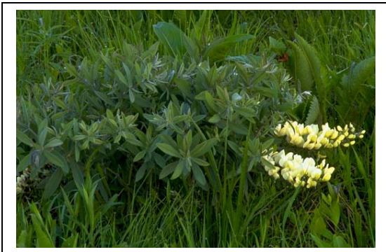
Cream Wild Indigo

The state nursery will grow 50,000+ plant plugs from the seeds provided by Midewin for a cost of $50,000. The plants will be grown during the winter months of 2006. The plugs will be planted at Midewin in restorations and in seed production beds during the spring months. Seed produced from these plants will be used for restoration in the future. Volunteers will provide most of the labor, planting the plugs and harvesting the seeds in the future.