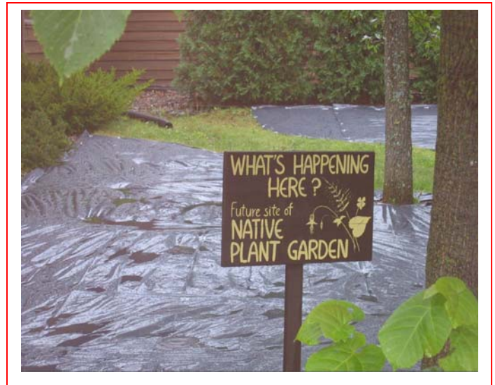
Site preparation for a native plant garden/nursery at the CNF S.O in Park Falls.