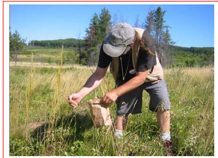
Collecting grasses at Moquah Barrens