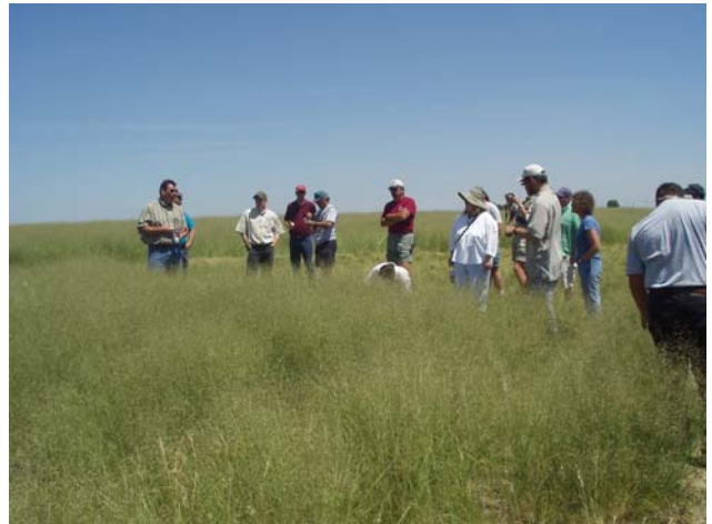
Tour of grass seed production fields in the Columbia Basin of eastern Washington

Our contracting assistance and support services ensure consistency and quality in native plant material development efforts in the PNW. Funding provided to this project allowed us to coordinate seed production contract activities, and assist agency personnel in the development and administration of seed orders. This project has facilitated the building of native plant programs and partnership opportunities, resulting in an increased use of native seed on federal lands affected by wildfires and other disturbances. As an example, nearly 20,000 pounds of native grass seed were used this fall on the School Fire (Umatilla National Forest) for fire suppression and emergency response seeding activities.