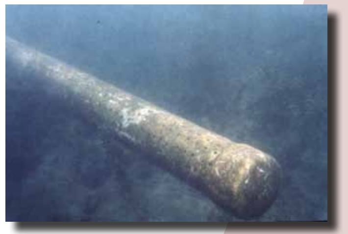
Perforated PVC screening water entering a pump.

Low-cost, simple-to-operate fish screens have been the goal for screen designers for many years. Most designers have given up on the quest after repeated episodes of plugging, dry ditches, and angry irrigators. Mention of a 'simple' fish screen draws wry smiles from experienced people, and we do not plan to invest energy where so many have failed before. Instead, we will catalogue the lowest-technology screens we can find, using contacts in State screen fabrication shops and fish and wildlife agencies. A web page will describe maintenance issues-the principal problem with fish screens-as well as what is known about effectiveness.