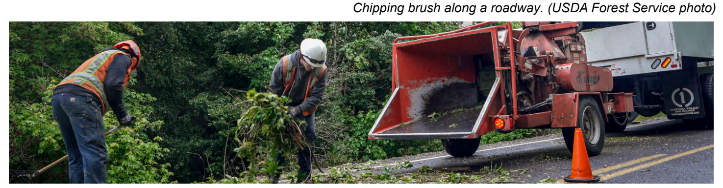
USDA is an equal opportunity provider, employer, and lender