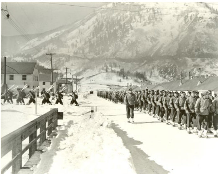
The U.S. Army's 10th Mountain Division in full winter gear in the mountains above Camp Hale.

The national monument designation builds on years of local and congressional efforts to provide recognition and protection for this area. Supporters include: Colorado Governor Jared Polis; the Colorado Department of Military and Veterans Affairs; local governments; over 40 regional and national stakeholders including wildlife, wilderness, mountain biking, snow-based recreation, veterans, hiking, and sportsmen's organizations; and over 200 local businesses. Importantly, descendants of 10th Mountain Division veterans, the 10th Mountain Division Foundation, and Colorado veterans groups also support the area's protection.