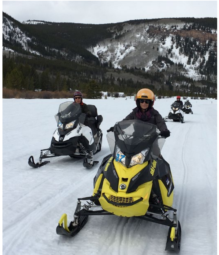
The Camp Hale-Continental Divide National Monument offers world-renowned winter recreation opportunities, including snowmobiling.

The monument designation only applies to National Forest System lands and the Federal mineral estate. The proclamation states that if the Federal Government were to voluntarily acquire any additional lands or interests in lands within the monument boundaries, those would be included in the national monument.