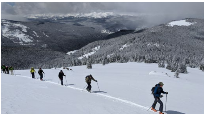
The slopes where the elite 10th Mountain Division trained for winter warfare in World War II now provide exceptional winter recreation opportunities.

Snowmobiling, ATV riding, hunting, camping, fishing, horseback riding, mountain biking, backcountry skiing, climbing, and other recreational uses are popular activities in the monument. There are two campgrounds in the monument, and more than 80 miles of hiking trails including a portion of the Continental Divide Scenic Trail and the Masontown Trail. There are also rental huts in the area that local guides and outfitters use to provide off-road vehicle and jeep tours, snowmobiling, snowcat tours, guided hikes and skiing, avalanche education, and children's outdoor activities. The Continental Divide and Tenmile Range within the national monument includes 10 peaks over 13,000 feet in elevation, and