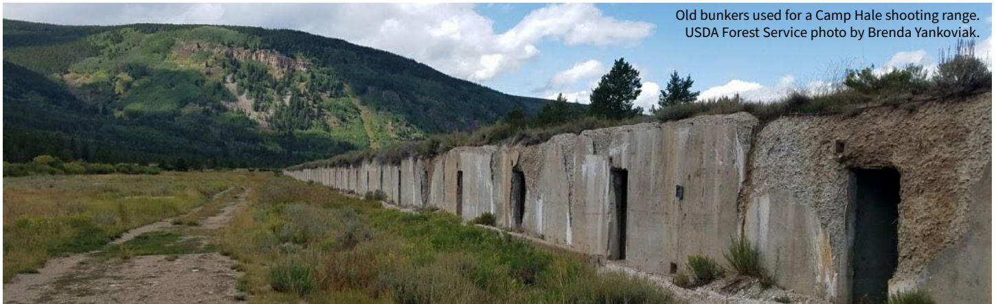
Old bunkers used for a Camp Hale shooting range.