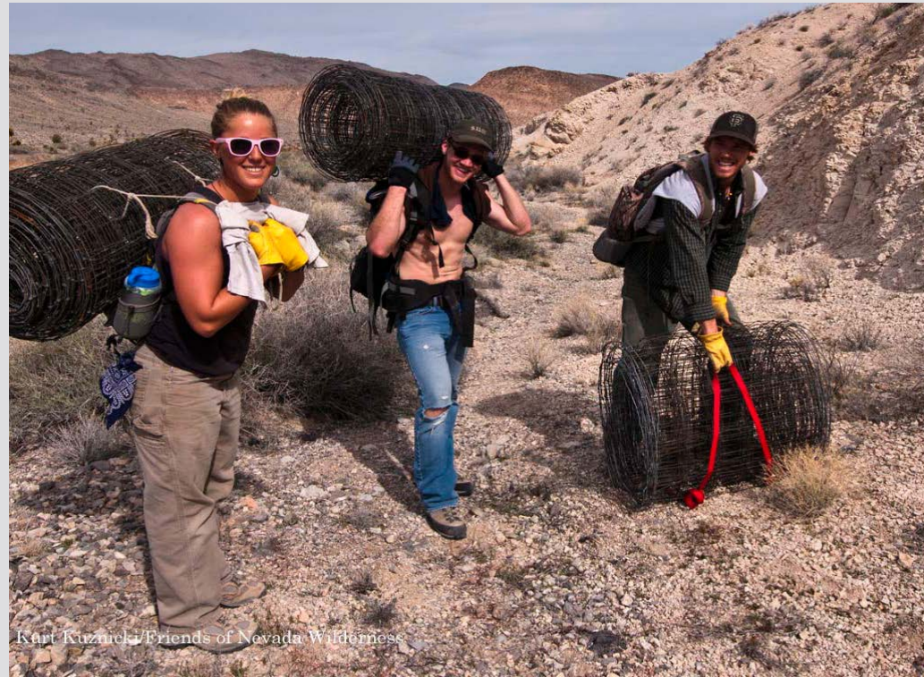
Karl Kuznicki/Friends of Nevada Wilderness

519 volunteers worked with SNAP and Friends of Nevada Wilderness to complete 25 wilderness stewardship projects, including removal of 4 tons of barbed wire, trail rehabilitation, removal of downed trees, and litter clean up.