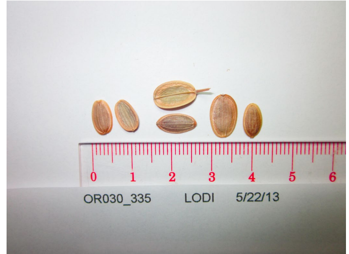
Figure 15. Fernleaf biscuitroot seed size variability. Scale is mm.

DeBolt and Parkinson (2005) rubbed fernleaf biscuitroot schizocarps through a 0.5-inch (1.3 cm) square openings to remove fine debris and then processed the collection through a sieve with 3.4-mm square openings (No. 6 USA STS) (Fig. 15). Seed can be sorted over a light table to remove empty mericarps if necessary for nursery plantings.