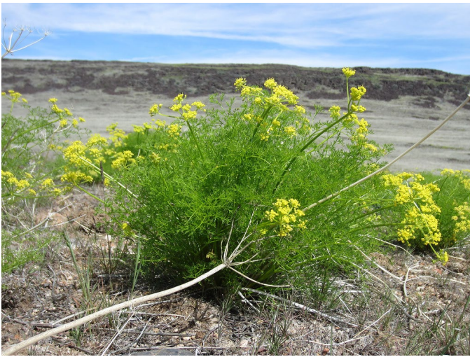
Figure 5. Fernleaf biscuitroot with bright green, heavily dissected leaves, and tiny yellow flowers in a compound umbel.