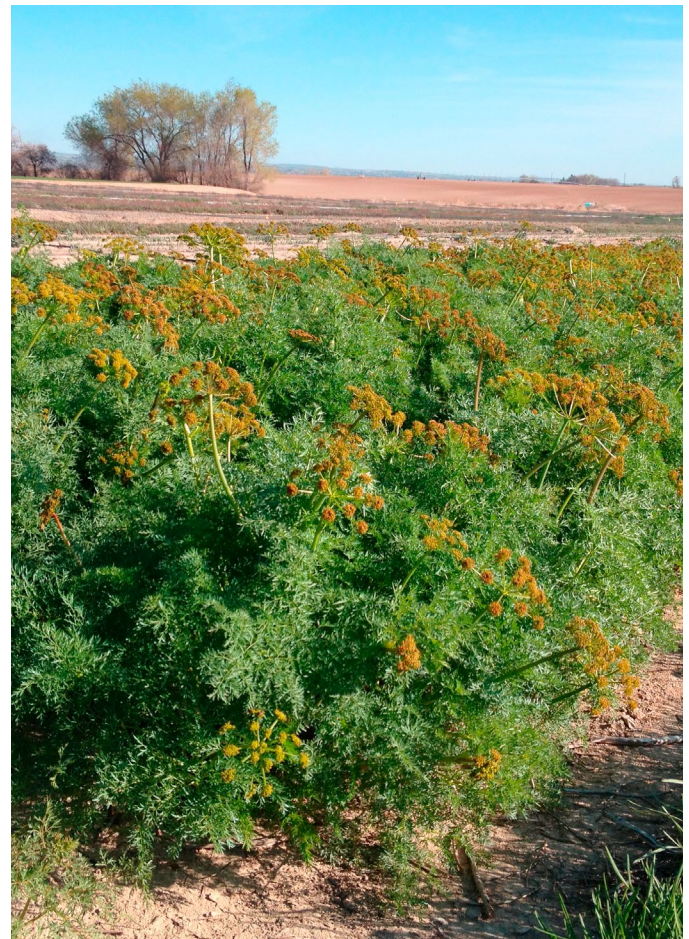
Figure 18. Fernleaf biscuitroot seed production plots at Oregon State University’s Malheur Experiment Station near Ontario, OR.

Seed Yields and Stand Life. At OSU MES, fernleaf biscuitroot seed was harvested for 7 years (Fig. 18) (Shock et al. 2016). Seed yields averaged 475 lbs/acre (532 kg/ha) for non-irrigated stands, 923 lbs/acre (1,035 kg/ha) for stands receiving 4 inches (100 mm) of irrigation, and 968.5 lbs/acre (1,085 kg/ha) for stands receiving 8 inches (200 mm) of irrigation. Seed production was significantly increased with irrigation ( P < 0.05 ), but seed yields were rarely significantly different between the 4- and 8-inch (100 and 200 mm) irrigation treatments (Table 6). Seed yields showed a quadratic response to irrigation and were estimated to be highest with (335-425 mm) of total applied water plus fall, winter, and spring precipitation (Table 9; Shock et al. 2016).