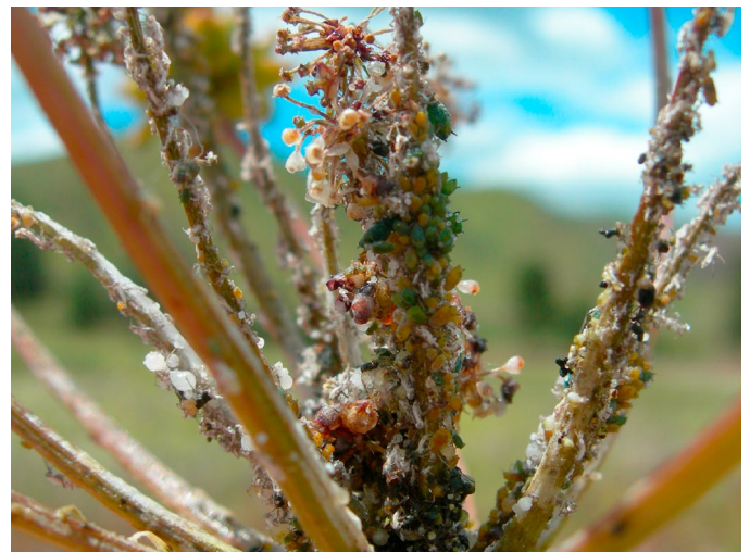
Figure 9. Fernleaf biscuitroot umbel covered with aphids at the USFS Lucky Peak Nursery near Boise, ID.

Fernleaf biscuitroot seed was taken by small mammals ( Peromyscus spp.), darkling beetles ( Eleodes nigrina ), and others in field experiments at Smoot Hill Biological Reserve (Thompson 1985). Piles of 5 and 10 fernleaf biscuitroot and nineleaf biscuitroot [ Lomatium triternatum ] seed were placed at 6.6-foot (2 m) intervals along three transects in mid-July 1981 and checked monthly. After 43 weeks (May 1982), just 9.1% of the seeds remained, and less than 2% of the remaining seeds were intact, suggesting few seeds would survive more than one winter. In experiments to determine if seed predators showed a preference between fernleaf and nineleaf biscuitroot species, piles of 300 seeds of both species were set out in mid-July 1983. All but 2 of 300 piles were discovered within the first month of trials. Significantly more fernleaf biscuitroot seed than nineleaf biscuitroot seed was taken ( P < 0.001 ). Seeds were taken more rapidly from pure fernleaf biscuitroot piles compared to pure nineleaf biscuitroot piles and preferentially taken from mixed-species seed piles ( P < 0.0001 ) (Thompson 1985).