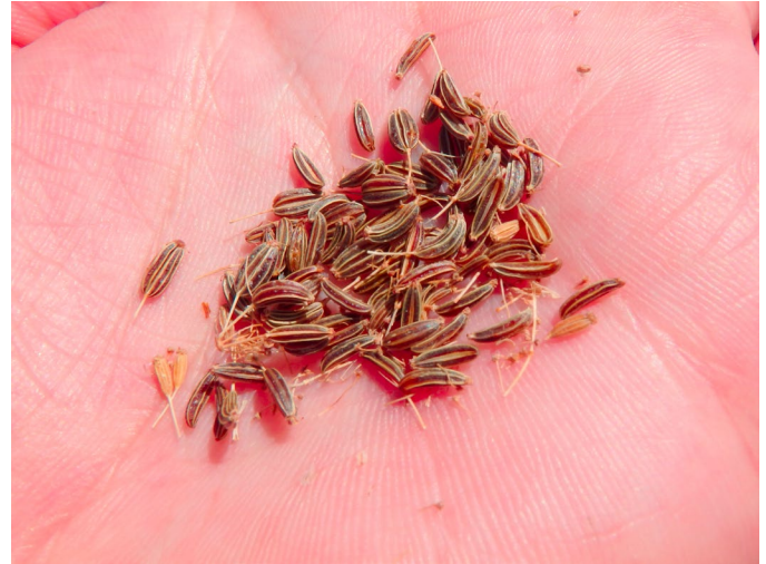
Figure 13. Hand-collected fernleaf biscuitroot seed. Schizocarps containing two seeds are visible.

3,431 feet (1,046 m) in Malheur County, Oregon. The latest collection was made on August 25, 2011 at 3,286 feet (1,002 m) in Boise County, Idaho. In the single year with the greatest number of harvests (18 collections in 2011) the earliest was June 14 at 3,143 feet (958 m) in Malheur County, Oregon, and the latest was August 25 at 3,286 feet (1,002 m) in Boise County, Idaho (USDI BLM SOS 2017), suggesting factors other than elevation are important to consider when estimating harvest dates. Regular monitoring of fernleaf biscuitroot populations is likely necessary for planning and maximizing fernleaf biscuitroot seed harvests.