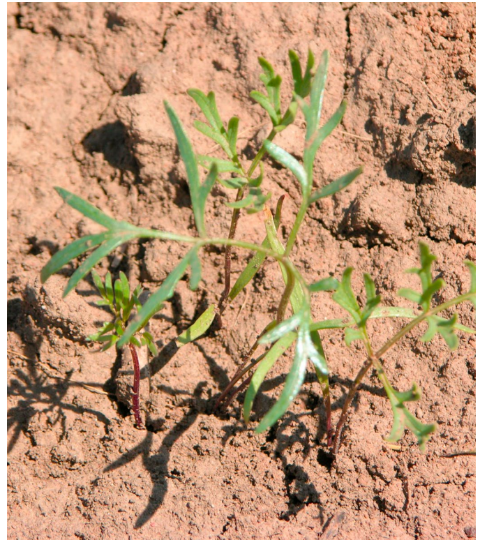
Figure 17. Fernleaf biscuitroot seedling growing at the Tom Day Farm in Layton, UT.

production plots. Taproots were not damaged, and plants survived transplanting well, suggesting this production may be used by seed growers looking to minimize the area devoted to the species in its non-productive years (Tilley et al. 2010).