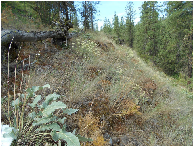
Figure 4. Fernleaf biscuitroot growing with grasses and arrowleaf balsamroot at the edge of a ponderosa pine forest.

Soils. Fernleaf biscuitroot grows in a variety of soil types, including rocky to fine-textured and acidic to alkaline soils (USU Ext 2017; Hitchcock and Cronquist 2018). While a variety of soil conditions are tolerated, including high \text{CaCO}_3 levels (LBJWC 2015), it is most common in well-drained, dry, rocky soils particularly those on talus slopes (Craighead et al. 1963; Taylor 1992). Fernleaf biscuitroot grows well in soils with pH of 6.5 to 7.5 (Tilley et al. 2010).