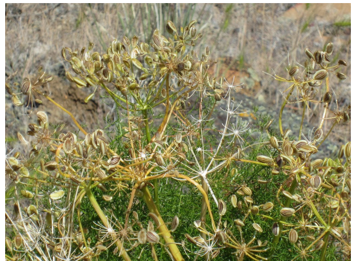
Figure 8. Fernleaf biscuitroot umbels with immature schizocarps.

Variety dissectum leaves are generally smaller (segments 2-8 mm long and 1.5-3 mm wide) than those of variety multifidum (2-22 mm long and 0.5-2 mm wide). Variety dissectum often produces maroon to purple flowers with 0.04 to 0.1-inch (1-3 mm) pedicels (Fig. 7), flowers can be yellow, but this is less common. Variety multifidum produces yellow flowers with 0.2 to 0.6-inch (5-15 mm) pedicels (Hickman 1993).