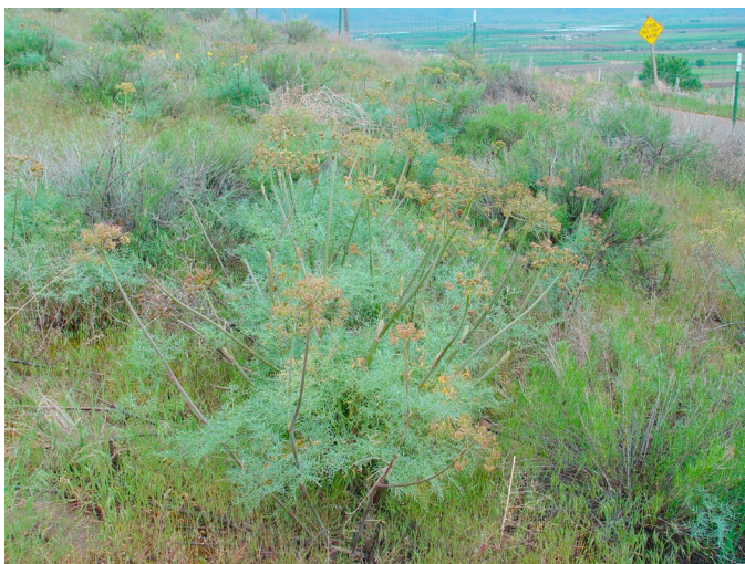
Figure 2. Fernleaf biscuitroot growing with big sagebrush, rabbitbrush, and cheatgrass near Homedale, ID.

In California, fernleaf biscuitroot occurs in rocky places in oak ( Quercus spp.) woodlands, pinyon-juniper ( Pinus-Juniperus spp.) woodlands, and mixed-conifer forests (ponderosa pine [ P. ponderosa ], California red fir [ Abies magnifica ], lodgepole pine [ P. contorta ]) (Munz and Keck 1973). In a study of soil, plant community, and climate relationships in south-central Idaho, fernleaf biscuitroot was a uniformly distributed, dominant species in basin big sagebrush ( Artemisia tridentata subsp. tridentata ) and antelope bitterbrush ( Purshia tridentata ) shrublands at Craters of the Moon National Monument. Here fernleaf biscuitroot production ranged from 394-513 lbs/acre (442-575 kg/ha) over four years (Passey et al. 1982). In a survey of little sagebrush ( A. arbuscula ) and black sagebrush ( A. nova ) communities in northern Nevada, fernleaf biscuitroot constancy was 100% in little sagebrush-Thurber's needlegrass ( Achnatherum thurberianum ) communities and 40% in little sagebrush-Idaho fescue ( Festuca idahoensis ) communities. Fernleaf biscuitroot did not occur in black sagebrush-dominated shrublands (Zamora and Tueller 1973).