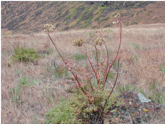
Figure 1. Fernleaf biscuitroot growing in a dry grassland near Craters of the Moon National Monument in south-central Idaho.

Habitat and Plant Associations. Fernleaf biscuitroot occurs in a variety of plant communities and environments ranging from rocky outcrops and dry open slopes to riparian habitats (Craighead et al. 1963; Hermann 1966; Andersen and Holmgren 1976; Crawford 2003). It is common in grasslands (Fig. 1), mountain meadows, and sagebrush ( Artemisia spp.) steppe (Fig. 2) and also found in desert shrublands, woodlands, and forests. In the Inland Northwest, fernleaf biscuitroot is common in meadow steppe, shrub steppe, and mountain meadow vegetation (Fig. 3) (Pavek et al. 2012). In the Columbia Basin of Washington, it is common in streamside Oregon white oak ( Quercus garryana )- and white alder ( Alnus rhombifolia )-dominated woodlands that experience temporary flooding (Crawford 2003).