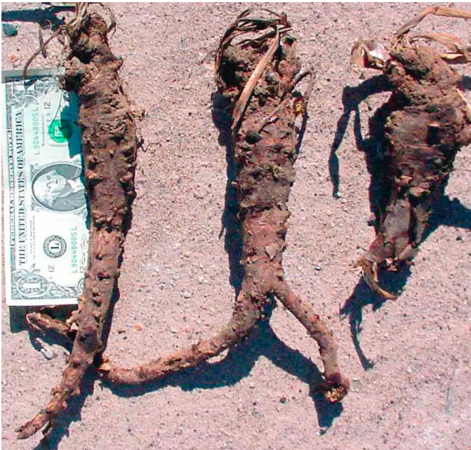
Figure 6. The thick, sometimes branching taproots of fernleaf biscuitroot support a stout caudex.

Flowers are produced in large compound umbels (Fig. 5) (Craighead et al. 1963). Peduncles (6-24 in [15-60 cm]) support umbels that are usually solitary (Welsh et al. 2016). Umbels produce 10 to 30 rays that vary in length from 1 to 5 inches (3-13 cm) long and are topped by umbellets (Munz and Keck 1973; Hickman 1993). Compound umbels are comprised of a combination of 50 to 200 male and bisexual flowers (Thompson 1998). All flowers are small, lack sepals, have five stamens, and five greenish yellow, yellow, or purple petals (Fig. 7) (Taylor 1992). Male flowers lack pistils and are common on the central, shorter rays (see Reproduction section) (Andersen and Holmgren 1976; USU Ext 2017). Bisexual flowers produce dry, two-seeded fruits (schizocarps) (Fig. 8) (Taylor