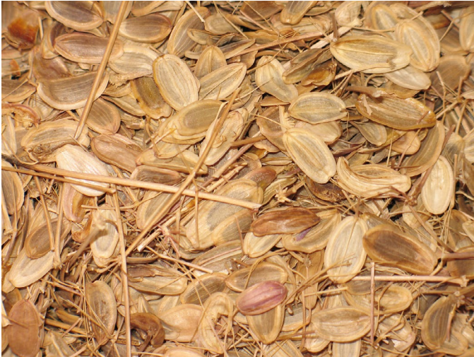
Figure 14. Bulk collection of fernleaf biscuitroot seeds.

seeds similar in shape and size to those of fernleaf biscuitroot.