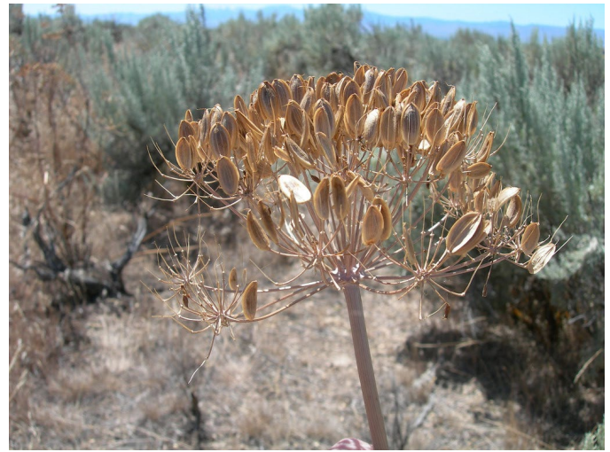
Figure 10. Single fernleaf inflorescence with some schizocarps attached but others dispersed.

Seed and Seedling Ecology. Controlled studies suggest that fernleaf biscuitroot may produce a seed bank (Scholten et al. 2009), although a proportion will likely be lost to predation (Thompson 1985, 1986). In experiments, viability was reduced but not lost to dehydration (Scholten et al. 2009). In this study, dehydration of imbibed seed was used to simulate spring drying of seeds to test the potential survival of ungerminated seed. Dehydration of seeds that were cold stratified for 10 weeks reduced seed viability from 96% to 61%. Seeds surviving dehydration did not germinate after being rehydrated but did germinate after 7 weeks of cold moist stratification. While final germination of dehydrated seed (33%) was much lower than that of control seeds (97%), 29% of ungerminated dehydrated seed remained viable but had deep dormancy, suggesting the potential for persistence in the seed bank. When fernleaf biscuitroot seeds were buried in mesh bags in mid-November, 31% of seed germinated by early March and 50% germinated by 2 June. Of the seed that remained ungerminated in the soil, 81% were viable. Viability decreased to 52% a month later, and to 30% by the start of fall (Scholten et al. 2009).