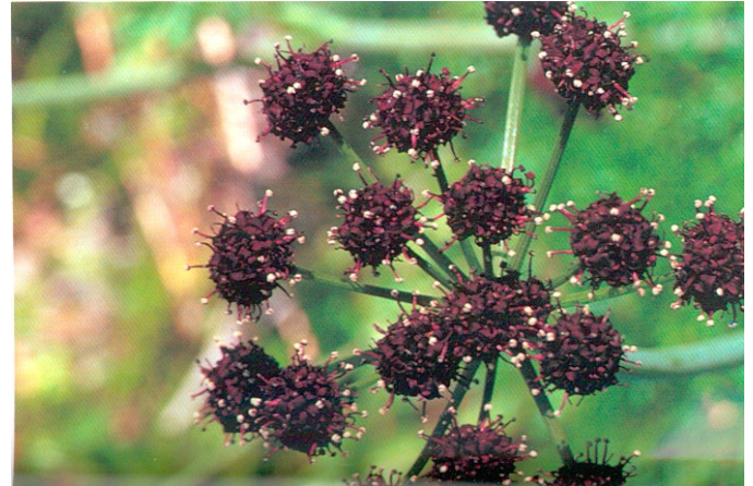
Figure 7. Lomatium dissectum var. dissectum with purple flowers, although they can be yellow.

1992). Schizocarps are flattened dorsally, oblong to oval, 0.4 to 0.6 inch (1-1.6 cm) long, 0.2 to 0.4 inch (0.4-1 cm) wide, and have flat-winged edges (Munz and Keck 1973; Hitchcock and Cronquist 2018). Schizocarps include two mericarps (seeds) that remain attached along their midlines until ripe. A single umbel can produce hundreds of seeds (Thompson 1985).