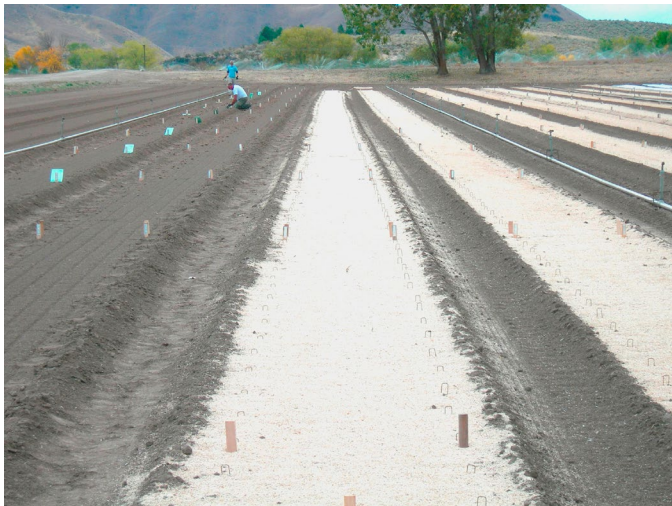
Figure 16. Site preparation for seeding fernleaf biscuitroot at USFS Lucky Peak Nursery (near Boise, ID). Beds at the center and on the right have already been seeded and covered with a thin layer of sand.

Aberdeen PMC and OSU MES. Good weed control was achieved using weed barrier fabric and hand rouging at the Aberdeen PMC (Ogle et al. 2012a). Non-selective foliar herbicide applications were used to control weeds after summer senescence of fernleaf biscuitroot (St. John and Ogle 2008; Ogle et al. 2012a).