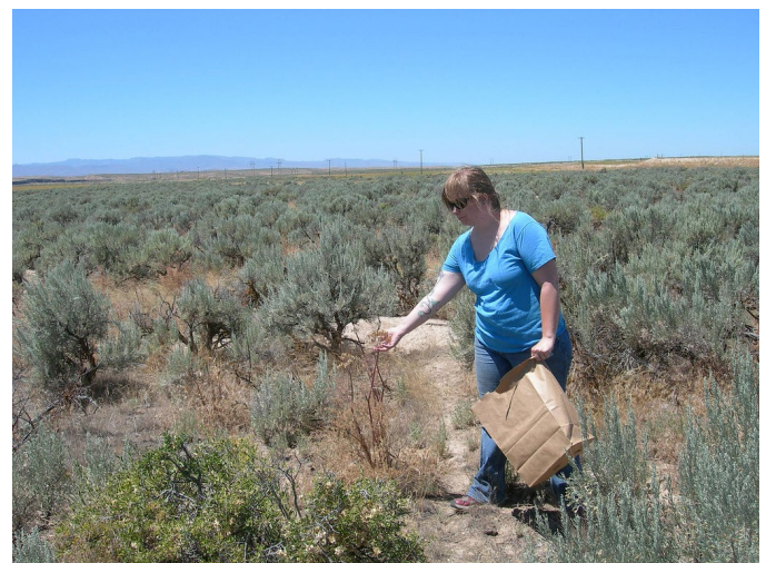
Figure 12. Hand collection of wild fernleaf biscuitroot seed.