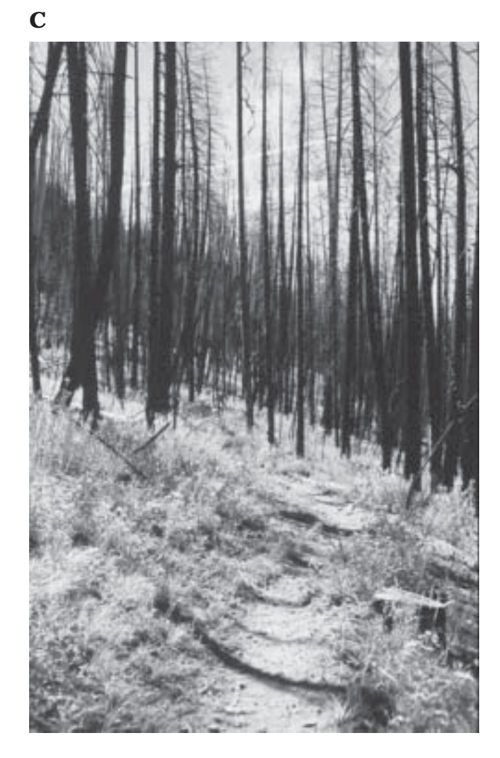
Figure 6 —Grass establishment following seeding of native species in 2000 (A—2000, B—2001, C—2002) in the Bob Marshall Wilderness, Flathead NF.