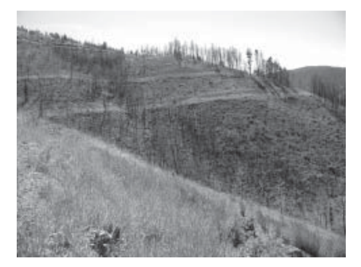
Figure 4 —Jammer road rehabilitation, Bitterroot NF.

Seeding Along Wilderness Trails —Selected trails in the Bob Marshall Wilderness, on the Flathead National Forest in northwest Montana, were hand-seeded to reduce