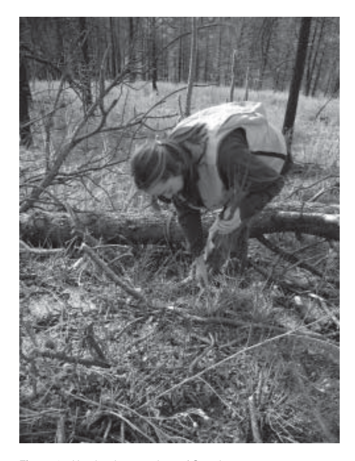
Figure 2 —Handcutting snowberry ( Symphoricarpus albus ) to produce rooted cuttings, Bitterroot NF.

Jammer Road Obliteration —Jammer roads resulted from the short line, high-lead logging systems of the 1950s through the 1970s. Fire restoration has provided an opportunity to obliterate these old jammer roads to restore hydrologic function and plant cover. One example is the road rehabilitation on the Bitterroot National Forest (Figure 4). Snowberry ( Symphoricarpos albus ) container seedlings were among the species planted on the roads; the seedlings were cultivated from cuttings collected locally (Figure 2). Ponderosa pine is planted in the harvest area. The entire area was aerially seeded with thickspike wheatgrass ( Elymus