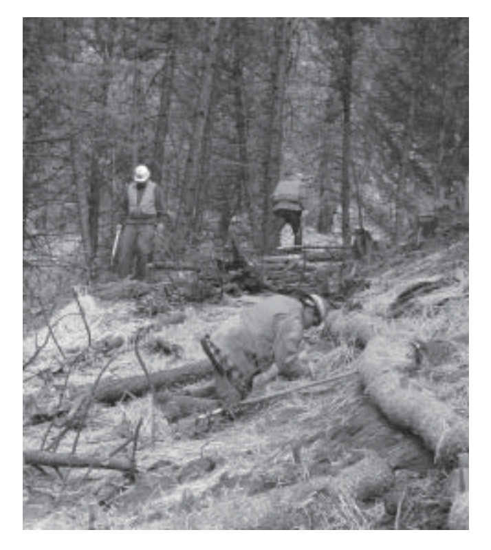
Figure 5 —Revegetation of access roads, Bitterroot NF.

erosion where trail sloughing was anticipated and to reduce noxious weed invasion after the wildfires in 2000 (Figure 6). On a portion of the trail within the Helen/Lewis II Fire area, blue wildrye ( Elymus glaucus ) was hand-seeded; the seed source was about 20 mi (32 km) from the seeding project. Mountain brome ( Bromus marginatus ) was also used on other trails. Monitoring will continue to determine success of seed germination, native plant recolonization, and effectiveness in reducing erosion and invasion by noxious weeds.