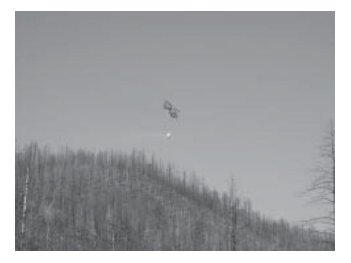
Figure 3 —Aerial seeding native grass species on the Black Mountain Fire, Lolo NF.

macrourus ) and slender wheatgrass ( Elymus trachycaulus ), which are both native.