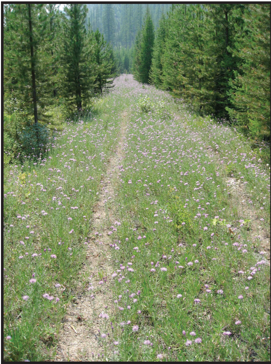
Spotted knapweed invading the forest from a road corridor

in wildlands. However, many of the tools being applied, such as herbicides and classical biocontrol, originated in much simpler agricultural systems. Effective use of such tools is more challenging within complex wildland ecosystems. Moreover, land management activities such as timber harvest, road building, burning, and grazing commonly exacerbate plant invasions. Thus, extensive research is needed in all aspects of invasive plant management in the Interior West. RMRS research programs have developed critical information for the following four key research areas related to invasive plants.