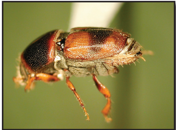
Banded Elm bark beetle