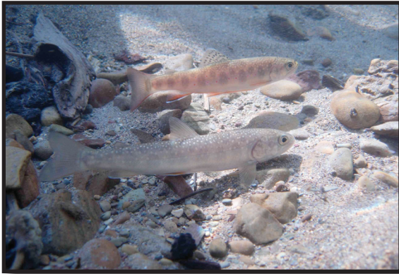
Nonnative brook trout, top, and threatened native bull trout, bottom. Brook trout may displace bull trout through competition and hybridization.

RMRS scientists have long focused their research on nonnative aquatic species, namely salmonid fish—brook trout, brown trout, and rainbow trout—that were introduced to promote recreation but that also have substantially