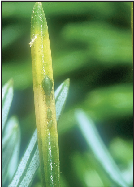
Spruce aphid.