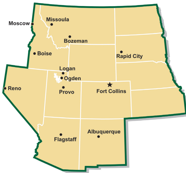
Figure 1—The area served by RMRS supports about half of the National Forest lands and nearly all of the National Grasslands.

members work closely with land managers and other partners from domestic and international agencies and universities to incorporate scientific findings into management plans.