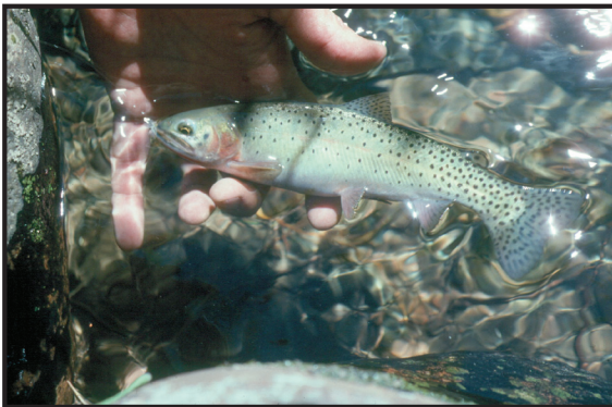
Native Colorado River cutthroat trout, often at risk from invasions by nonnative fish

altered aquatic communities throughout the West. Effects on aquatic systems produced by climate change suggest that large numbers of cool-water fishes and other kinds of invasive aquatic organisms—crayfish, mussels, amphibians, macroinvertebrates, aquatic plants, and nonindigenous pathogens—will become issues. RMRS research programs have developed critical information for the following four key research areas related to invasive aquatic species.