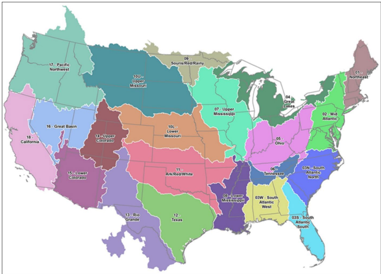
Figure 1. NHD production units

The flow metric files cover all U.S. NHD regions/production units (Figure 1). Canadian and Mexican land areas are not included in this dataset.