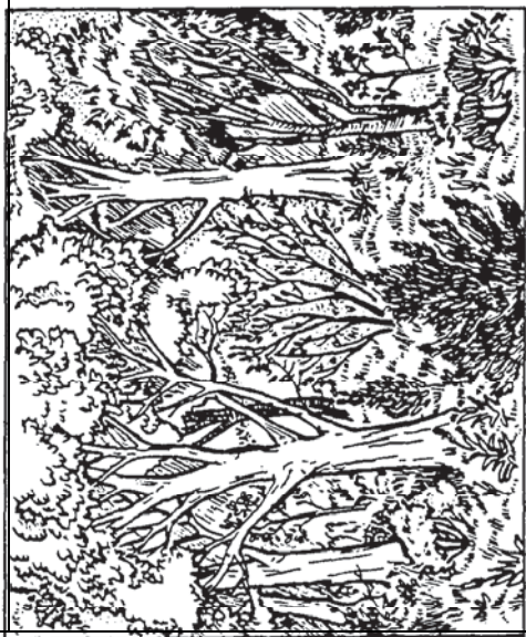
Illustration by WJU